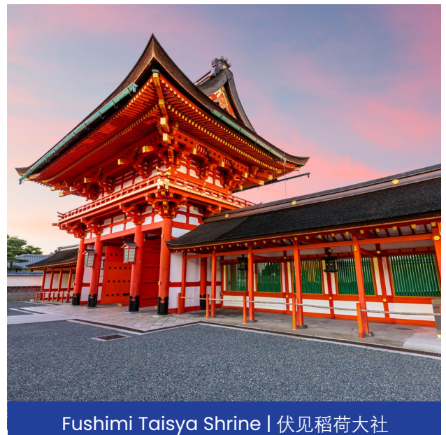
Fushimi Taisya Shrine | 伏見稻荷大社