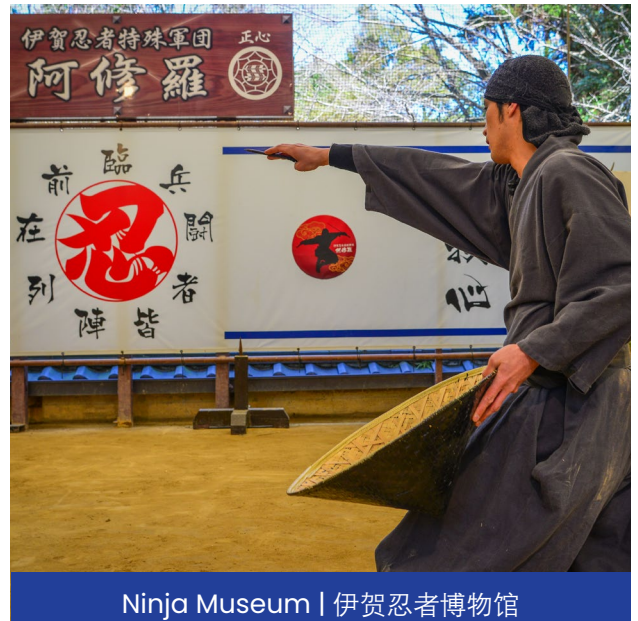
Ninja Museum | 伊賀忍者博物館