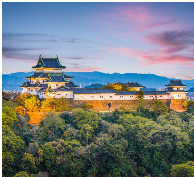
Wakayama Castle | 和歌山城