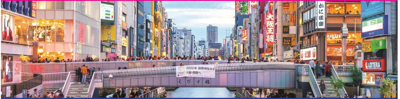
Dotonbori | 道顿堀