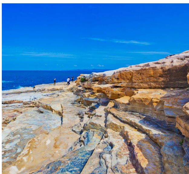
Senjojiki | 千畳敷