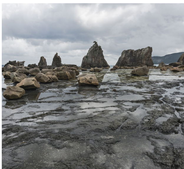
Hashikuiwa Rocks | 渡桥杭