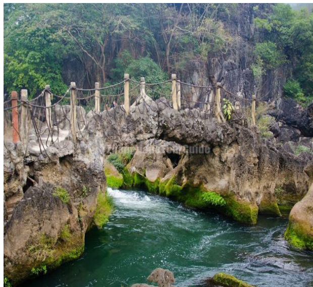
Tianxing Bridge Scenic Area | 天星桥景区