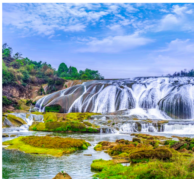
Doupotang Waterfall | 陡坡塘瀑布