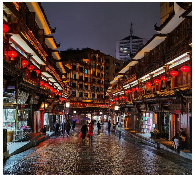
Shiban Ancient Street | 石板老街