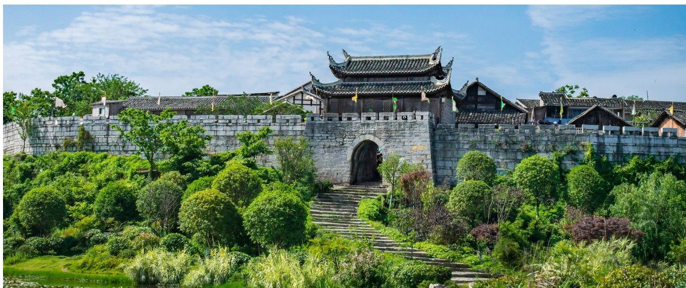
600-year-old Qingyan Ancient Town | 600年青岩古镇