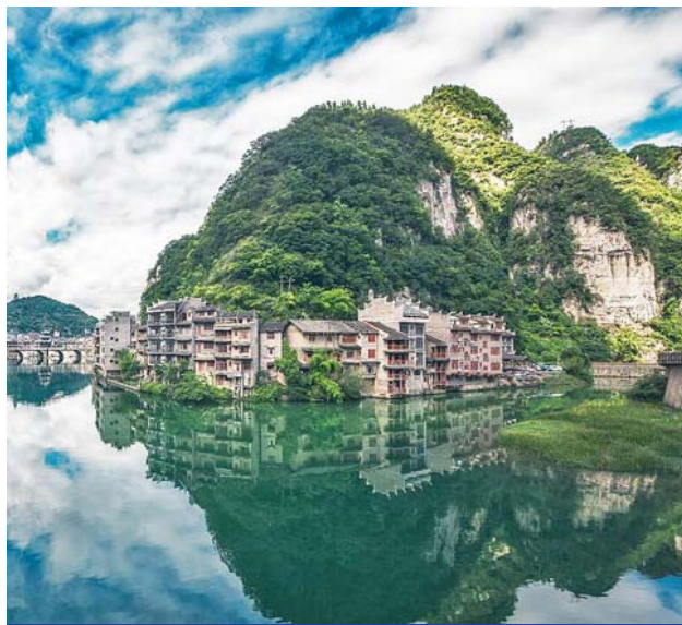
Zhenyuan Ancient Town | 镇远古镇