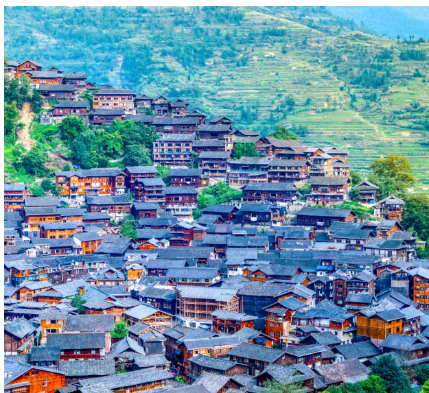
Xijiang Qianhu Miao Village | 西江千户苗寨