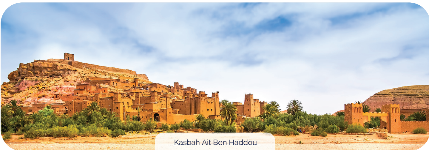
Kasbah Ait Ben Haddou