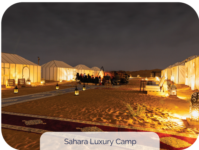
Sahara Luxury Camp