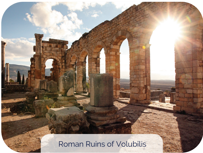
Roman Ruins of Volubilis