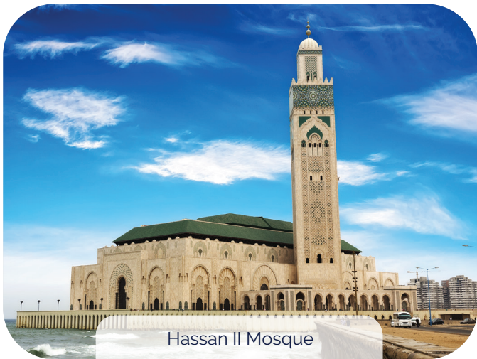
Hassan II Mosque