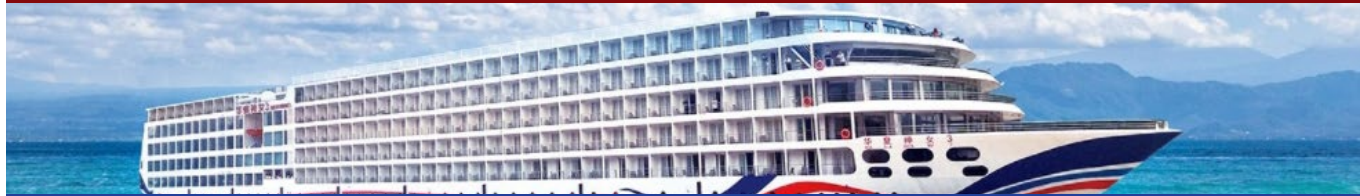
Luxury Goddess No.3 Cruise | 豪华神女3号游轮