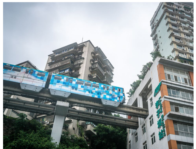
Liziba Light Rail Station | 李子坝轻轨站