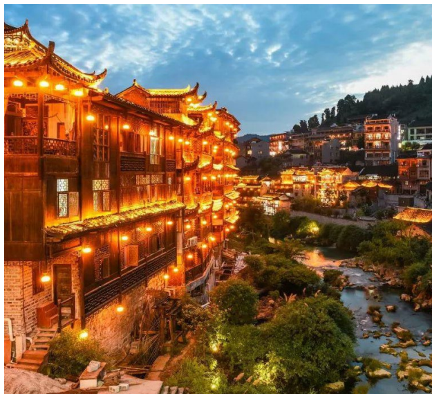
Daxiaohe Streets | 大小河街