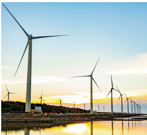
Gao Mei Wetland | 高美湿地