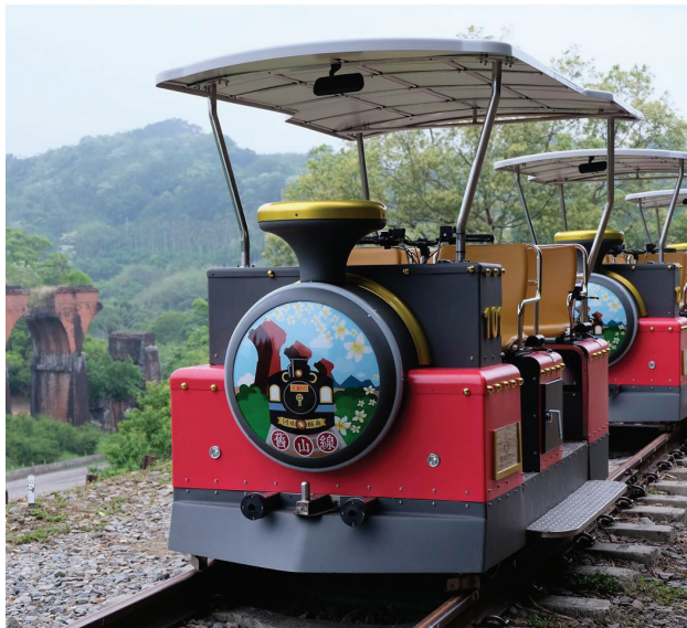
Old Mountain Line Rail Bike | 旧山线铁道自行车