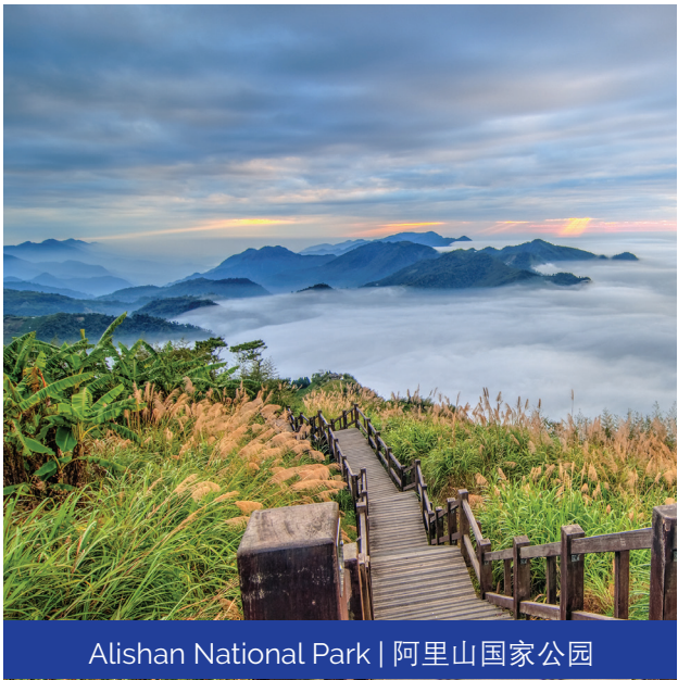
Alishan National Park | 阿里山国家公园