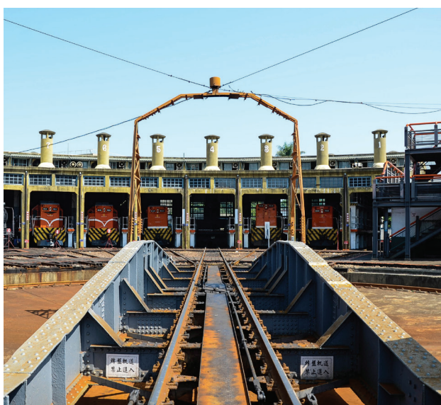
Changhua Roundhouse | 彰化扇形车库