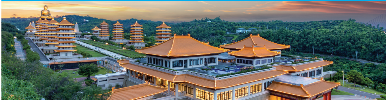
Fo Guang Shan Buddha Museum | 佛光山佛陀纪念馆