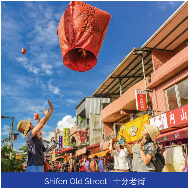
Shifen Old Street | 十分老街