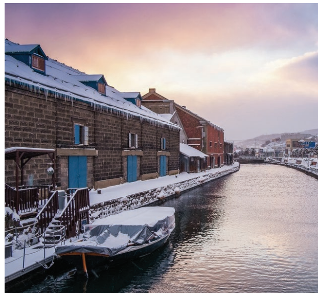
Otaru Canal | 小樽运河