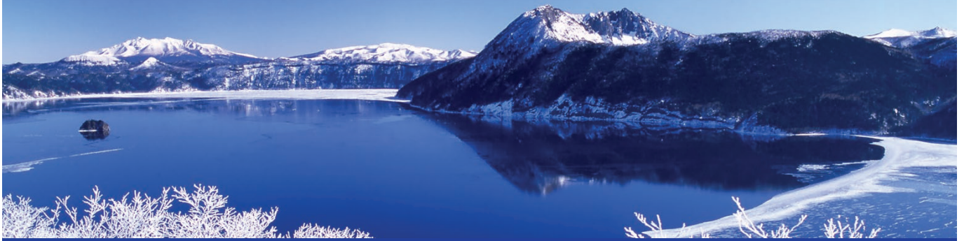
Lake Mashu | 摩周湖