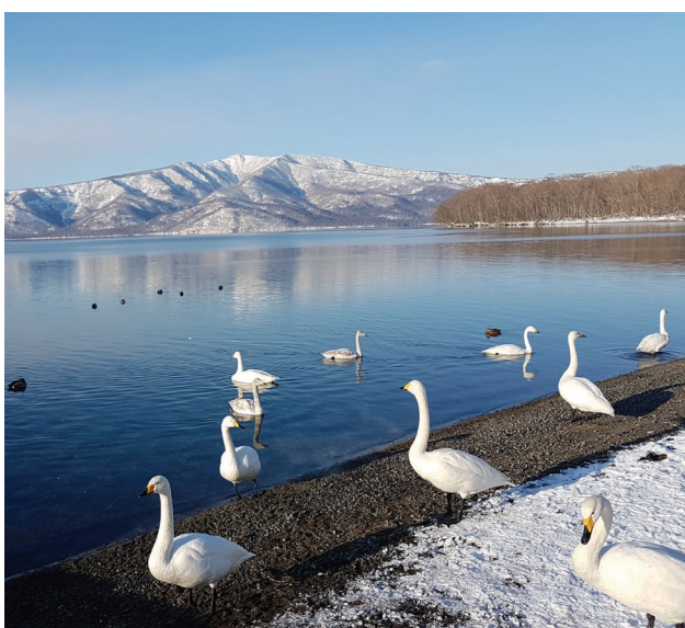
Kussharo Lake | 屈斜路湖