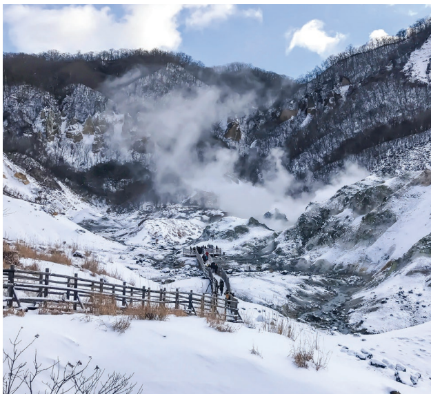
Jigokudani | 地獄谷