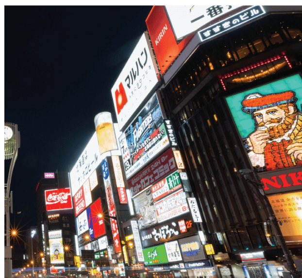
Susukino | 薄野区