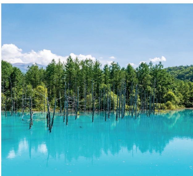
Blue Pond | 美瑛育池