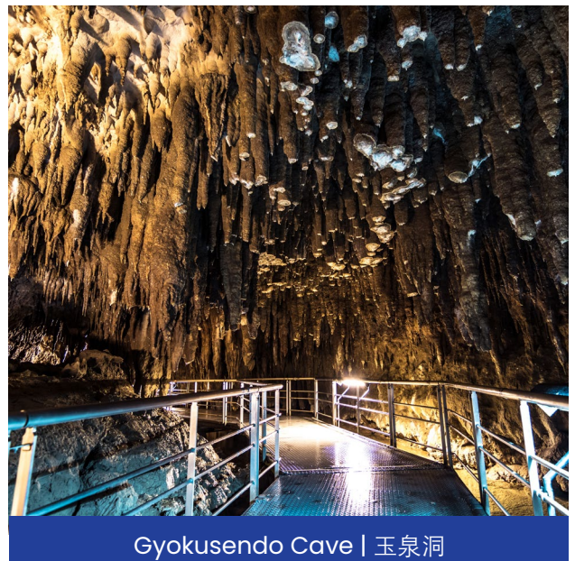
Gyokusendo Cave | 玉泉洞