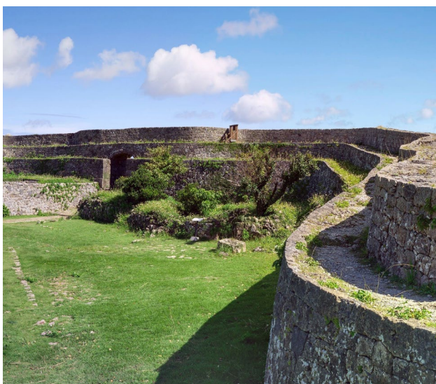
Nakagusuku Castle | 北中城