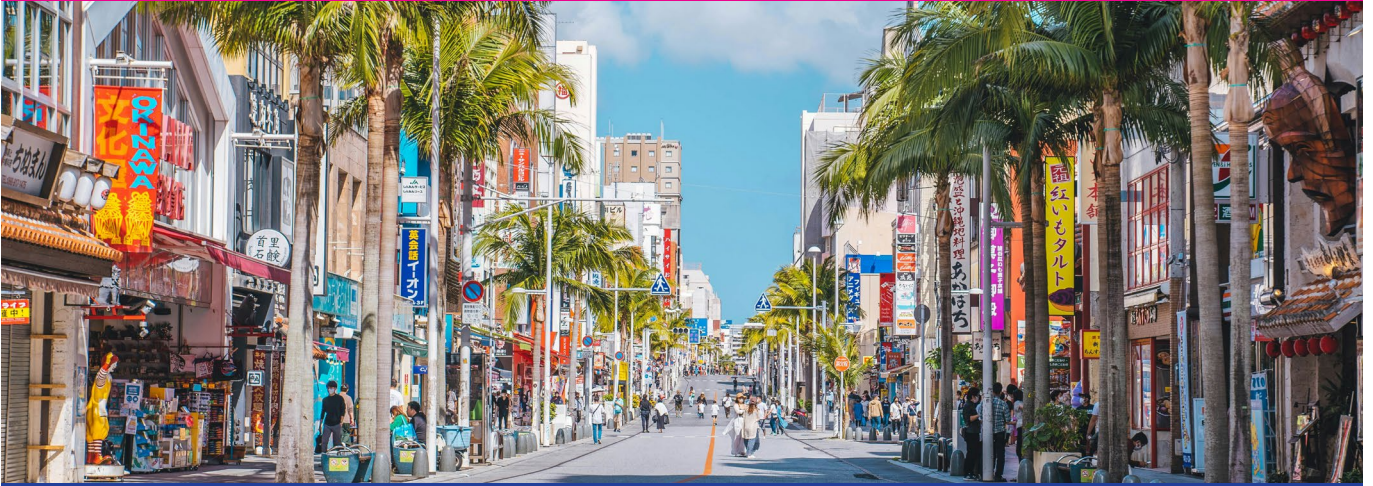
American Village | 北谷町美国村