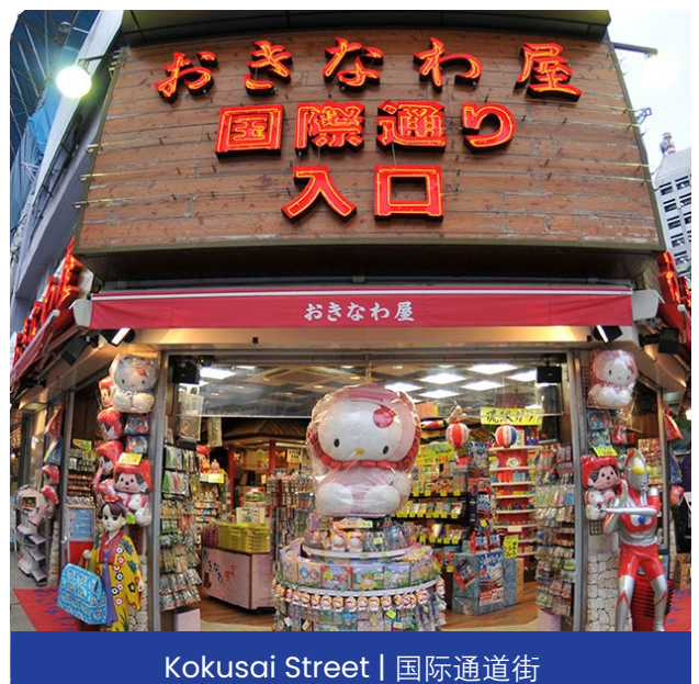
Kokusai Street | 国际通道街