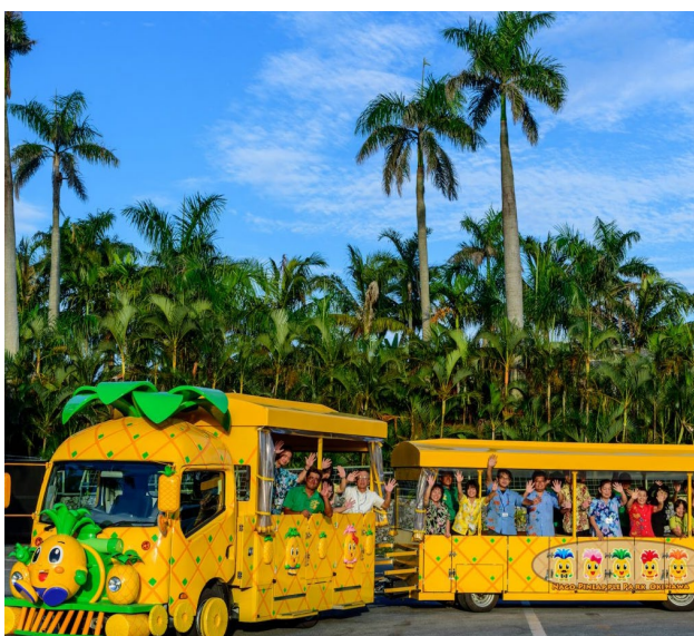
Nago Pineapple Park | 名护菠萝园