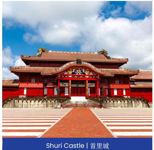
Shuri Castle | 首里城