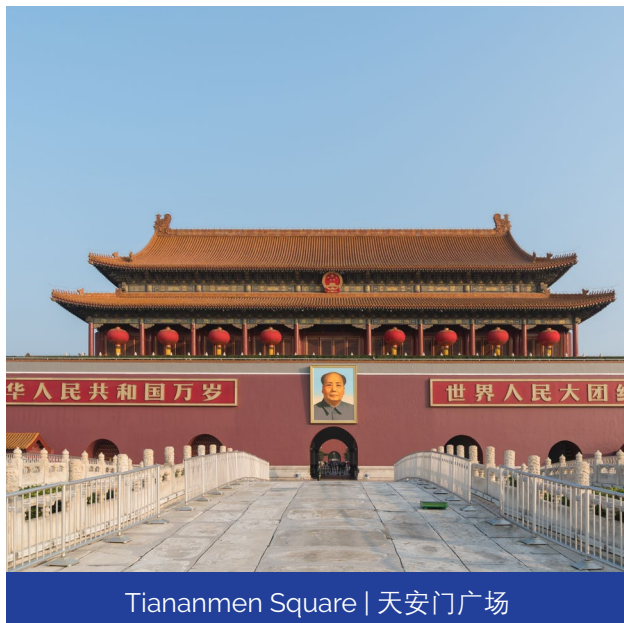
Tiananmen Square | 天安门广场