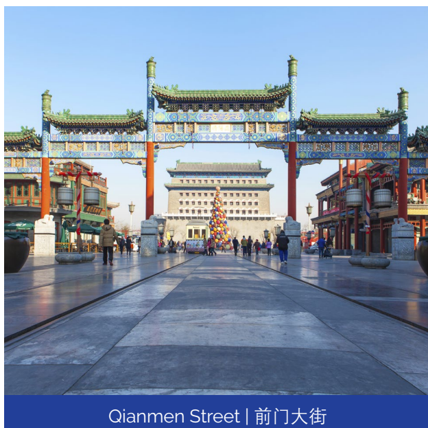
Qianmen Street | 前门大街