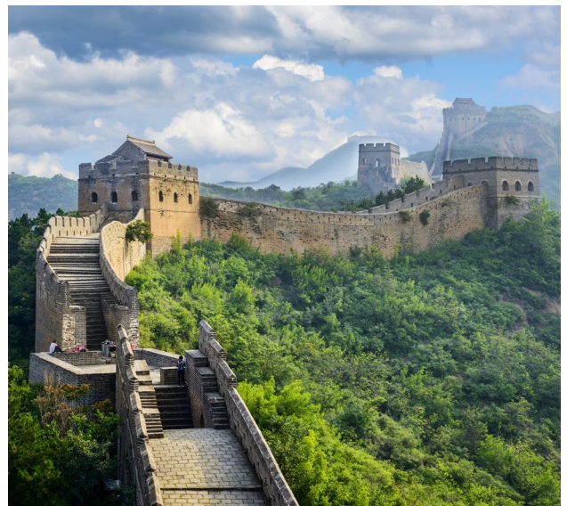
Simatai Great Wall | 司马台长城