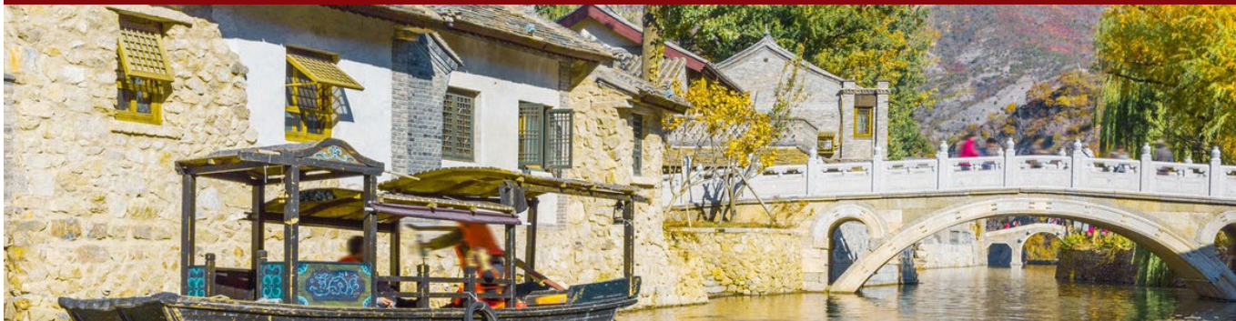
Gubei Water Town | 古北水镇