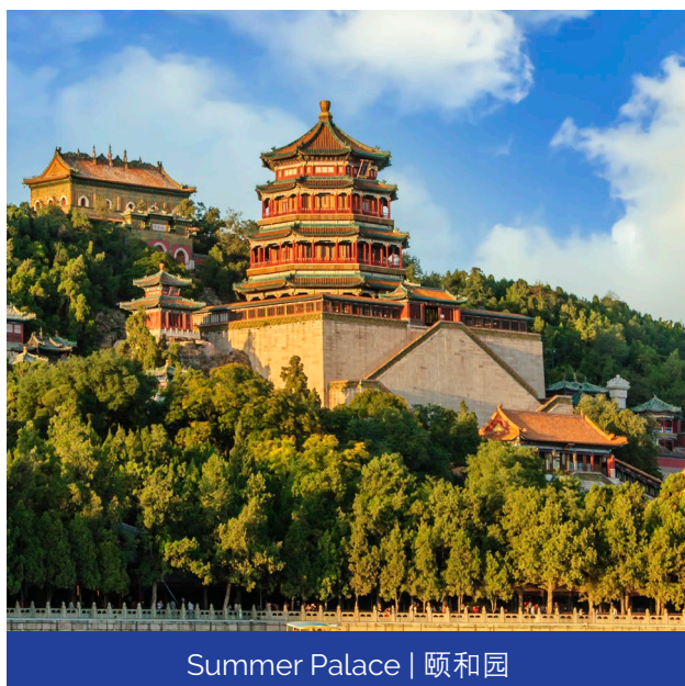
Summer Palace | 颐和园