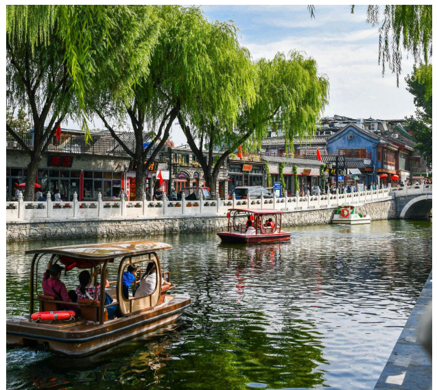
Shichahai | 什刹海