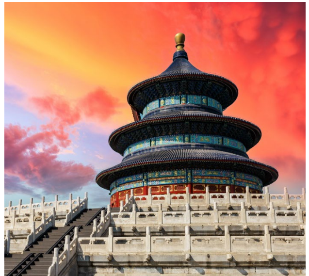
Temple of Heaven | 天坛