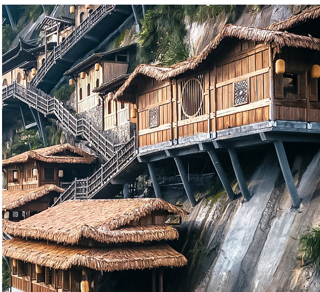
Wangxiangu Valley Scenic Area | 望仙谷景区

Accommodation: Holiday Inn Express or similar