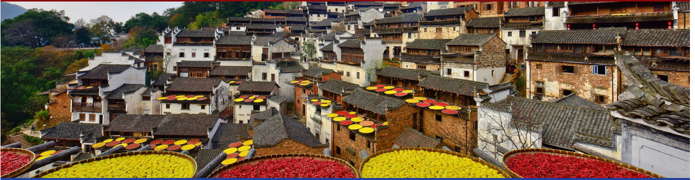
Huangling Scenic Area | 篁岭景区