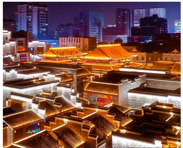
Wanshou Palace Historical Cultural Street | 万寿宫历史文化街