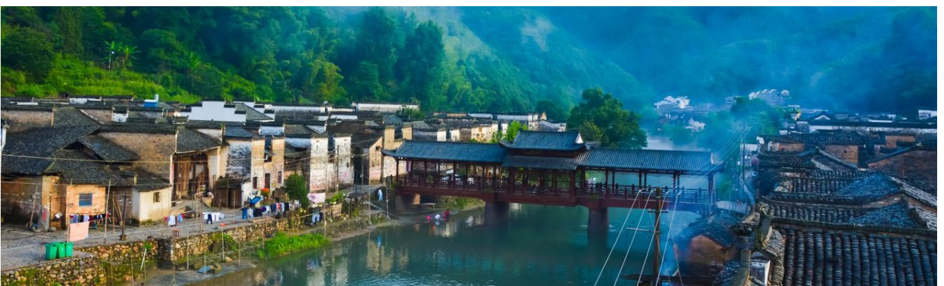
Yaoli Ancient Town | 瑶里古镇