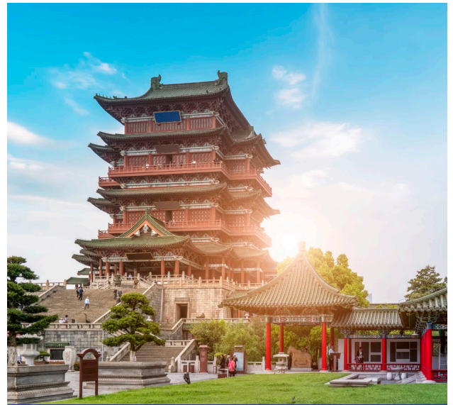
Tengwang Pavillion | 滕王阁