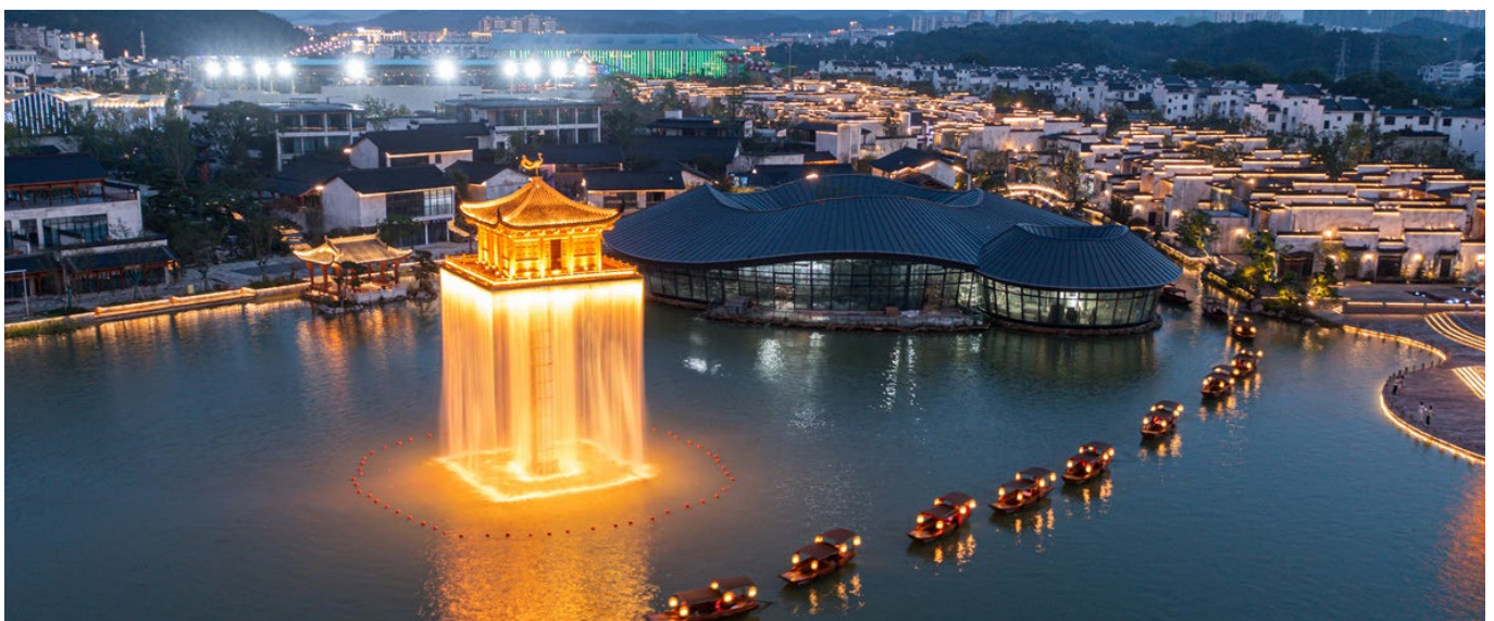
Wunüzhou | 婺女洲