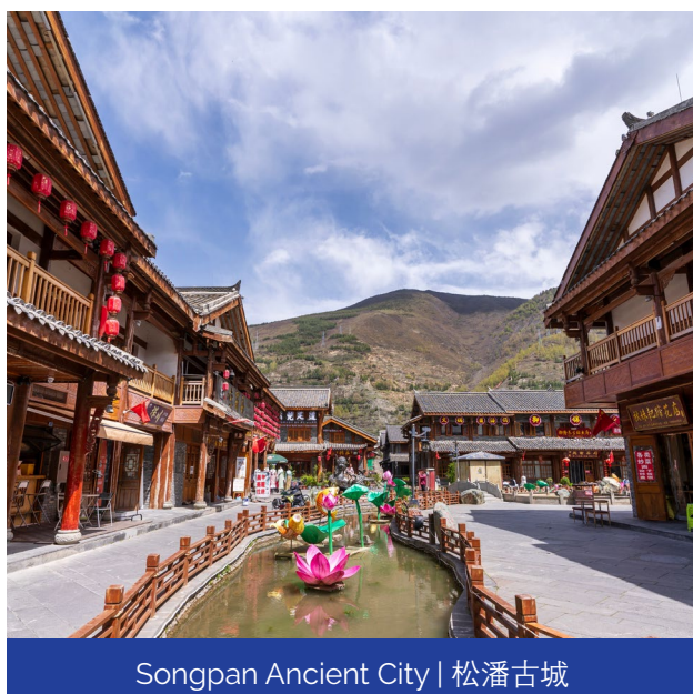
Songpan Ancient City | 松潘古城