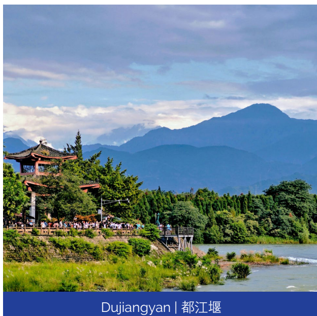
Dujiangyan | 都江堰