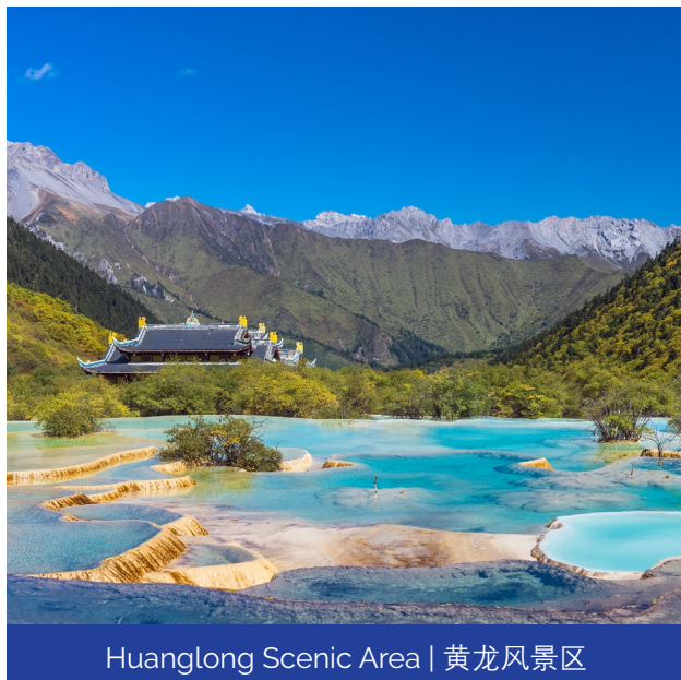
Huanglong Scenic Area | 黄龙风景区