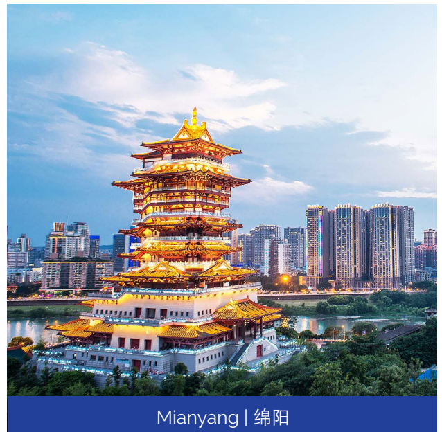
Mianyang | 绵阳