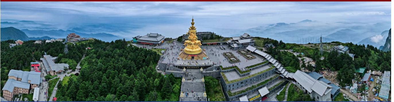
Emei Mountain Golden Summit | 峨眉山金顶