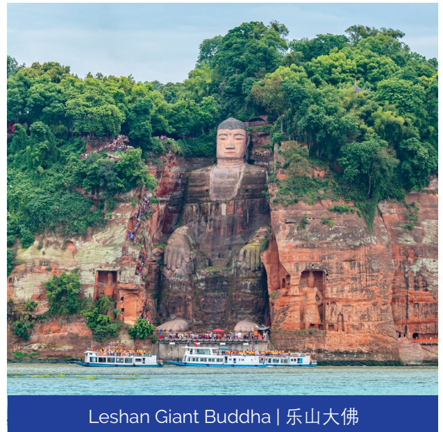
Leshan Giant Buddha | 乐山大佛