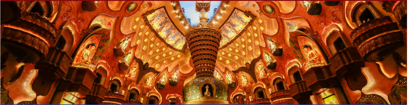
Niushou Mountain Zen Cultural Scenic Area | 牛首山禅意文化风景区