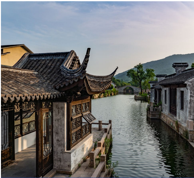
Huishan Ancient Town | 惠山古镇