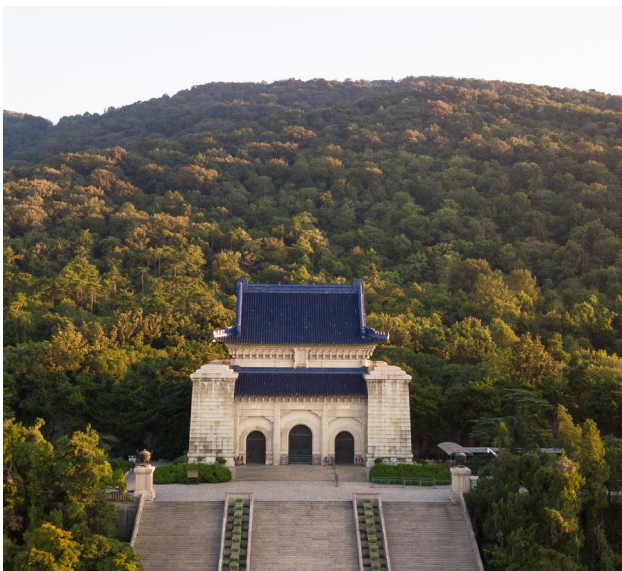
Sun Yat-sen Mausoleum | 中山陵