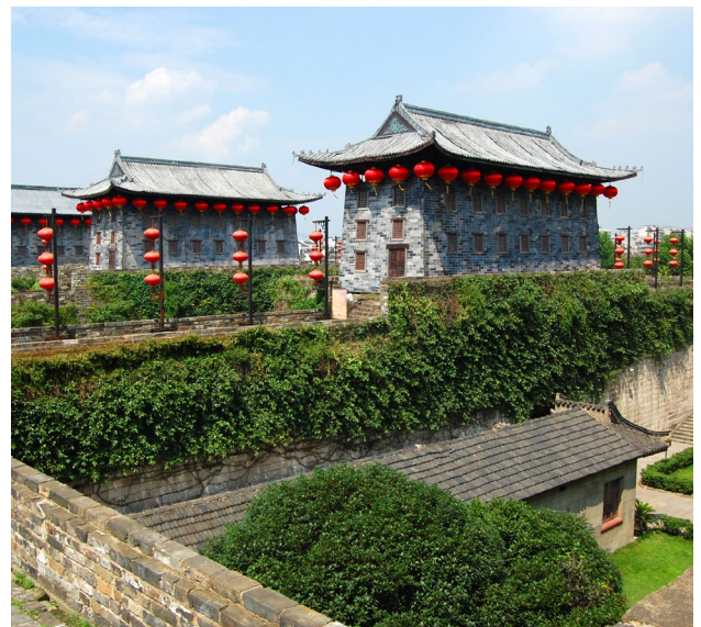
Zhonghua Gate | 中华门