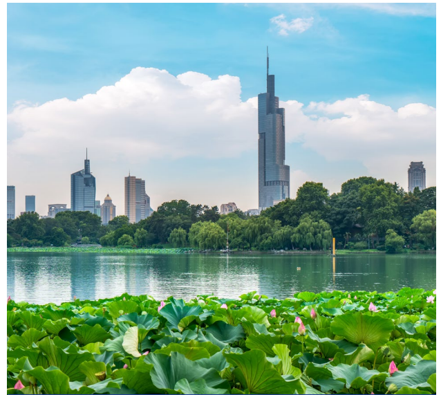
Xuanwu Lake | 玄武湖

Accommodation: Zhenbao Holiday Hotel or similar