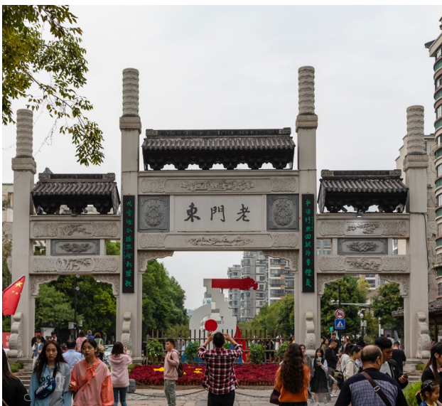
Laomendong | 老门东