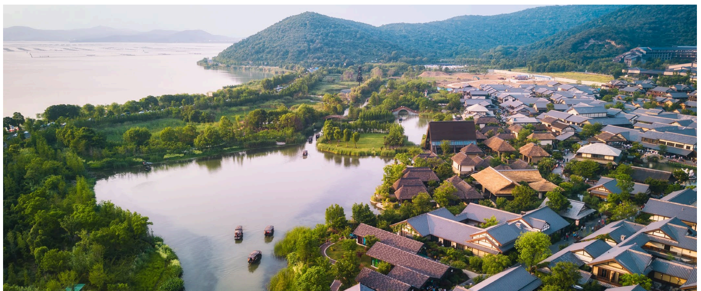
Nianhua Bay Town | 拈花湾小镇