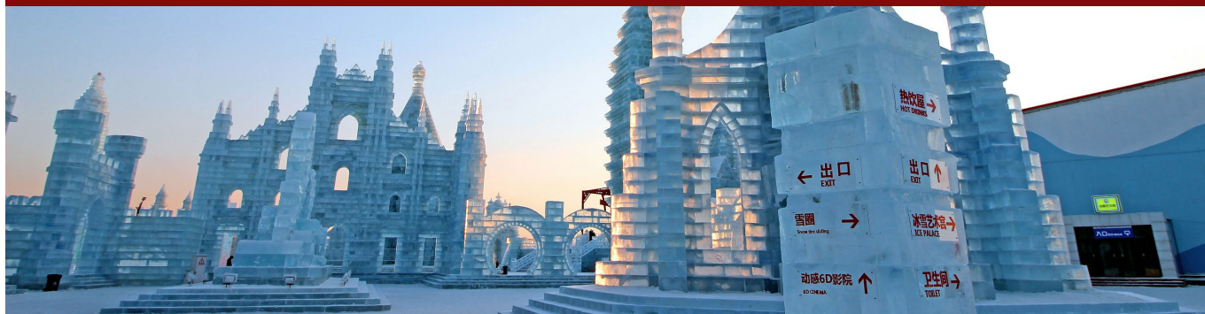
Harbin Ice and Snow World | 哈尔滨冰雪大世界