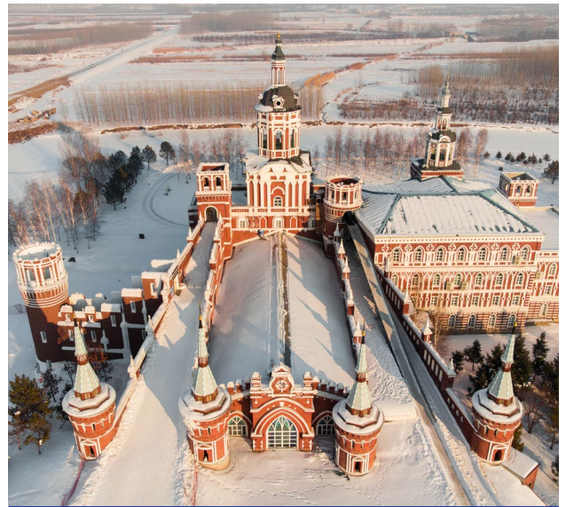
Volga Manor | 伏尔加庄园