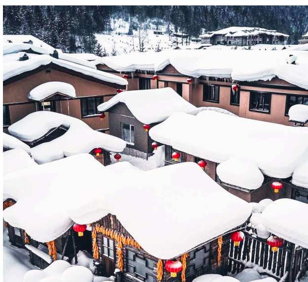
Snow Town Scenic Area | 雪乡旅游风景区