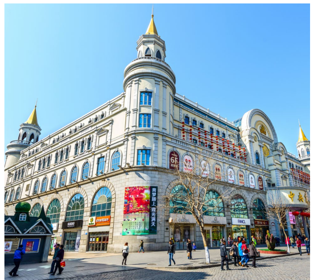
Harbin Central Street | 哈尔滨中央大街