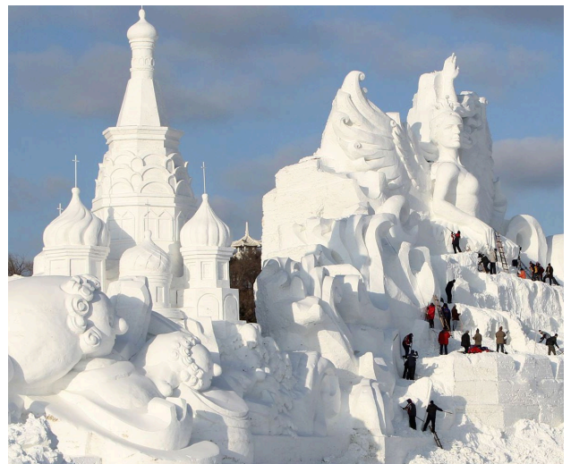
Sun Island Snow Sculpture Art Expo | 太阳岛雪博会