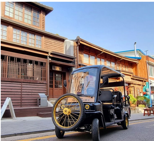
Eco Friendly Electric Car Ride | 环保电动车