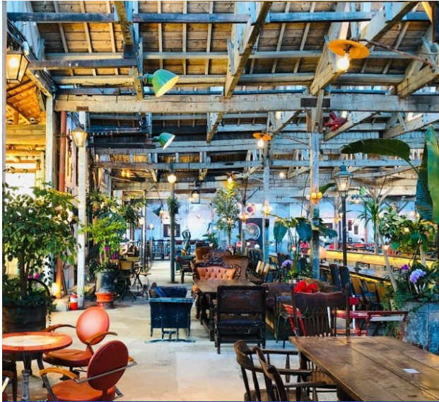
Joyangbangjik Café | 朝阳纺织咖啡屋