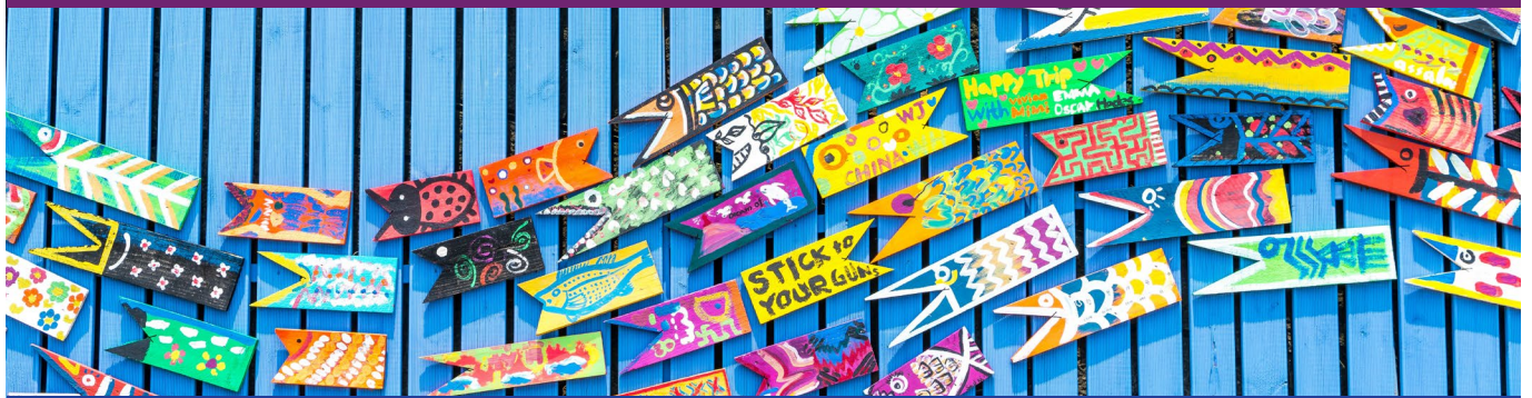
Gamcheon Culture Village | 甘川洞文化村