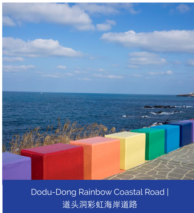
Dodu-Dong Rainbow Coastal Road | 道头洞彩虹海岸道路