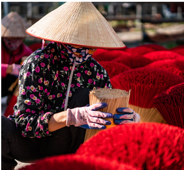
Incense Making Village | 顺化沉香村