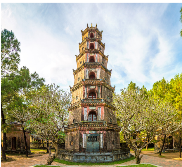
Thien Mu Pagoda | 天姥寺