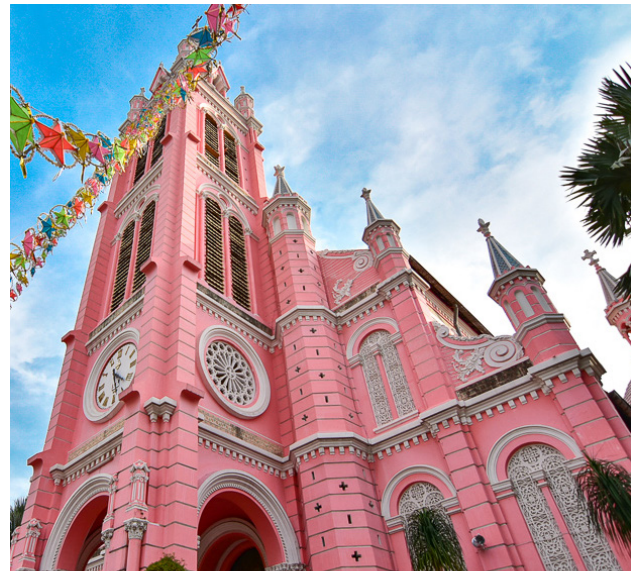
The Pink Church | 粉红教堂