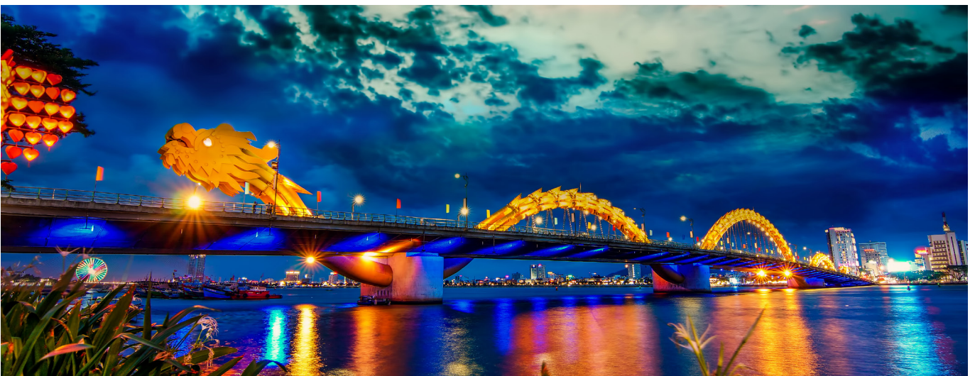
Dragon Bridge | 龙桥