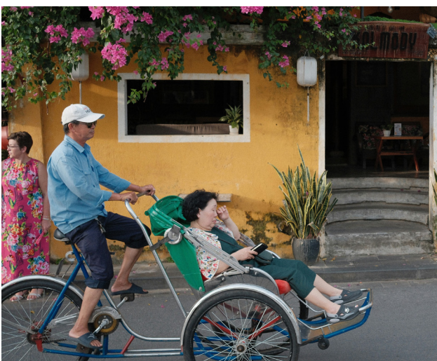
Trishaw Ride around the Citadel | 乘坐三轮车环绕皇城