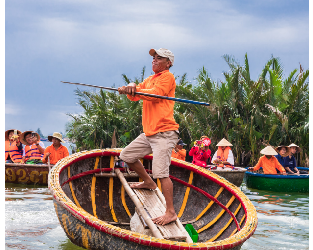
Cam Thanh Water Coconut Village | 迦南岛椰子村