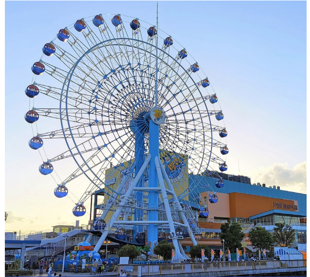
S-Pulse Dream Plaza | 清水梦幻广场