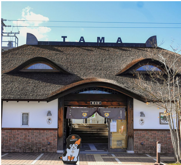
Tama Museum & Kishi Station | 多摩博物館和岸站