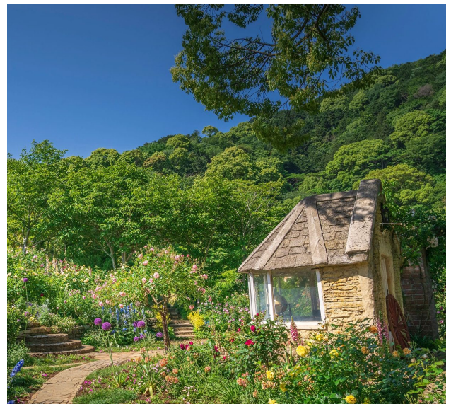
Acao Forest | 土地艺术公园