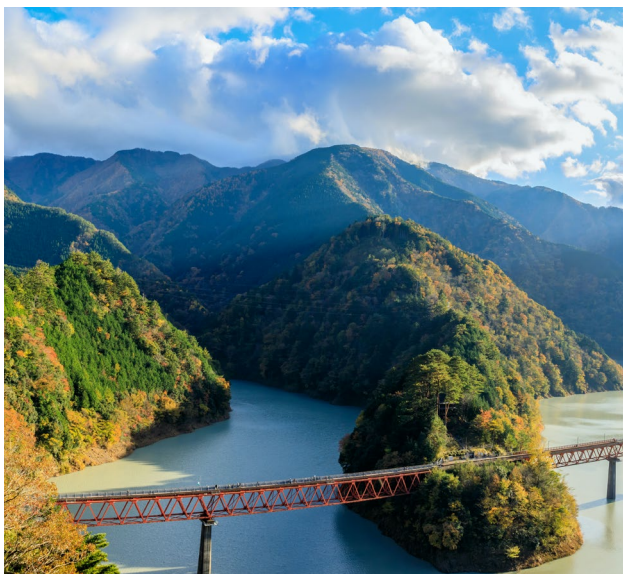
Okuikojo Station | 程奥大井湖上桥