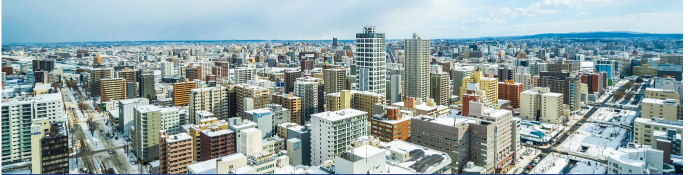
Sapporo | 札幌市