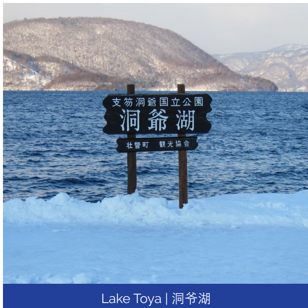
Lake Toya | 洞爺湖