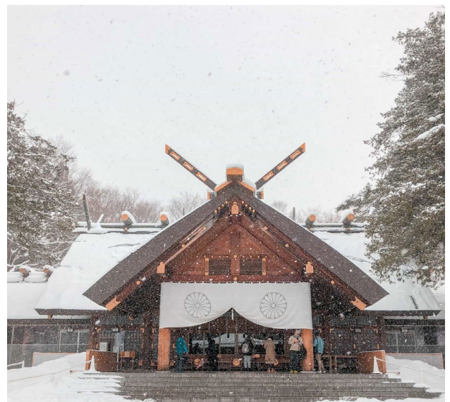
Hokkaido Jingu Shrine | 古老北海道神宮