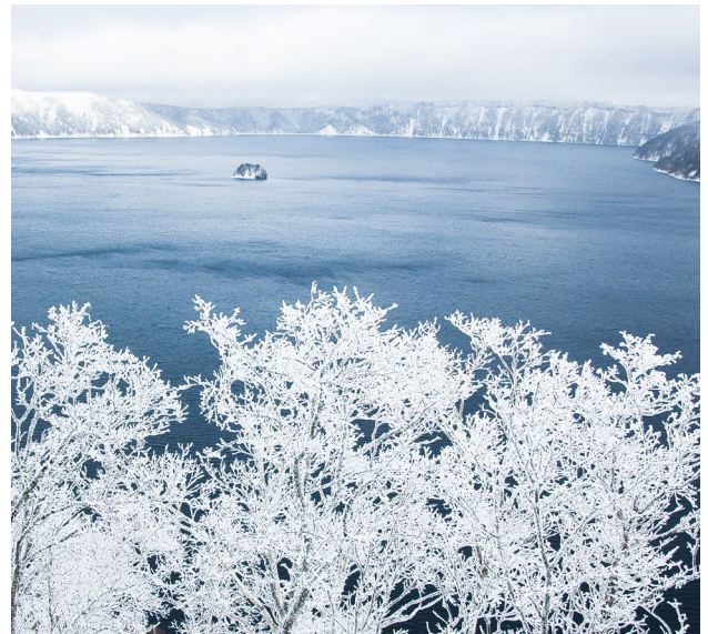
Lake Akan | 阿寒湖