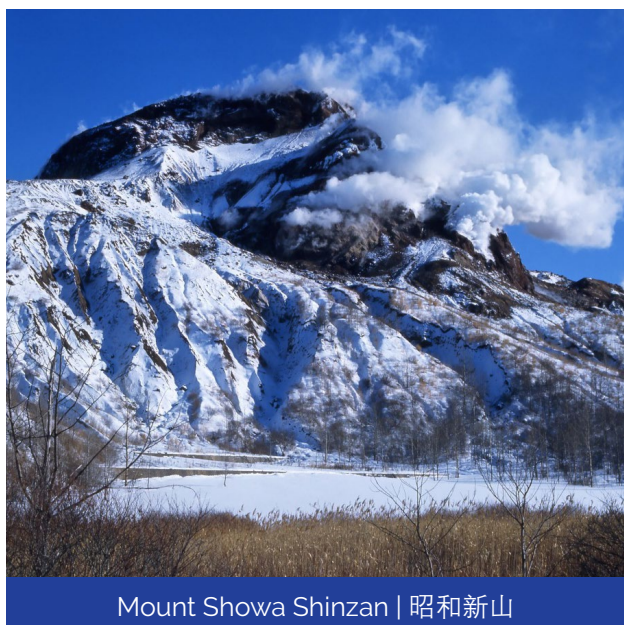
Mount Showa Shinzan | 昭和新山