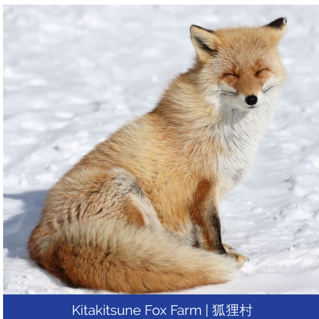
Kitakitsune Fox Farm | 狐狸村