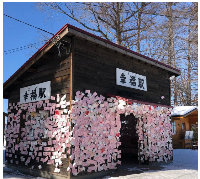
Kofuku Station | 幸福火车站