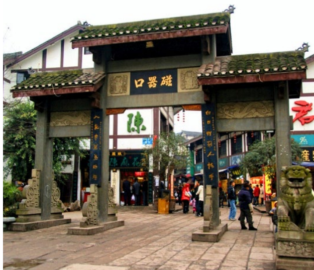
Ci Qi Kou Ancient Town | 磁器口古镇