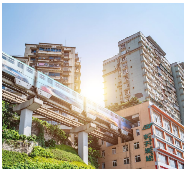
Liziba Monorail Station | 李子坝