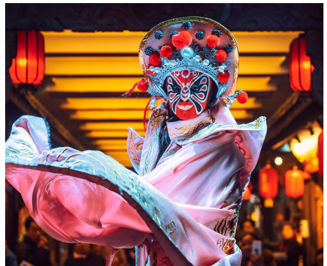
Sichuan Opera Face-Changing Show | 川剧变脸晚会