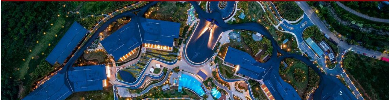
Club Med Joyview Heilongtan Resort | 地中海邻境黑龙滩度假酒店