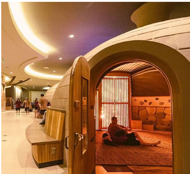
Jjimjilbang | 汗蒸房