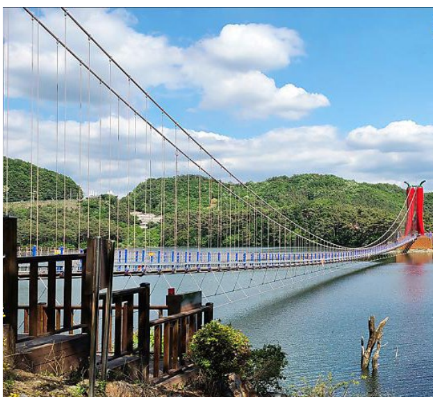
Cheonjangho Suspension Bridge | 天庄湖吊桥