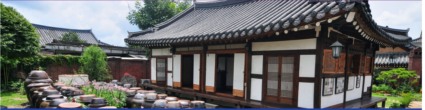
Jeonju Hanok Village | 全州韩屋村