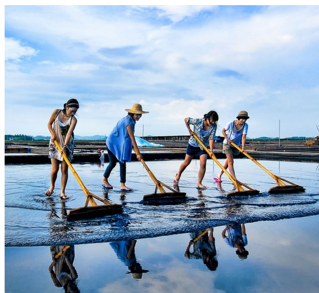
Taepyeong Salt Farm | 太平盐田