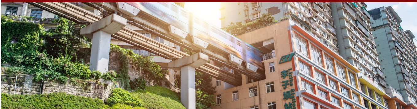
Liziba Station | 李子坝轻轨站

特色风味： 乌江鱼宴、三叶土鸡汤、高山土家菜、竹笼宴、竹笋宴、鹅府汤锅、特色洞子火锅、自助烤肉