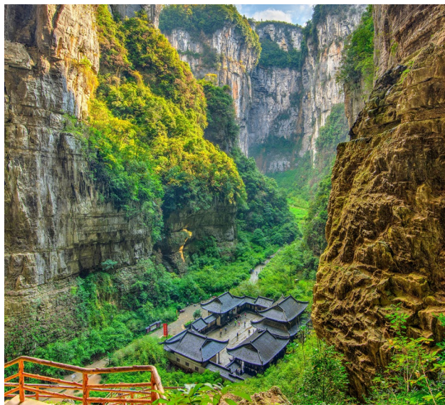
Three Natural Bridges | 天生三桥