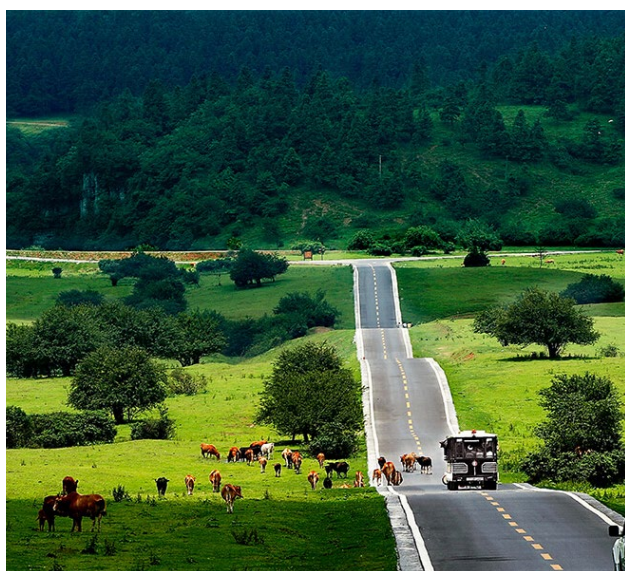
Fairy Mountain | 仙女山