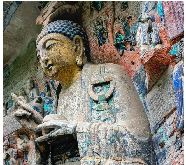
Baoding Mountain Rock Carvings | 宝顶山石刻