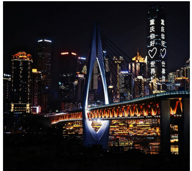
Two Rivers Cruise | 两江游船