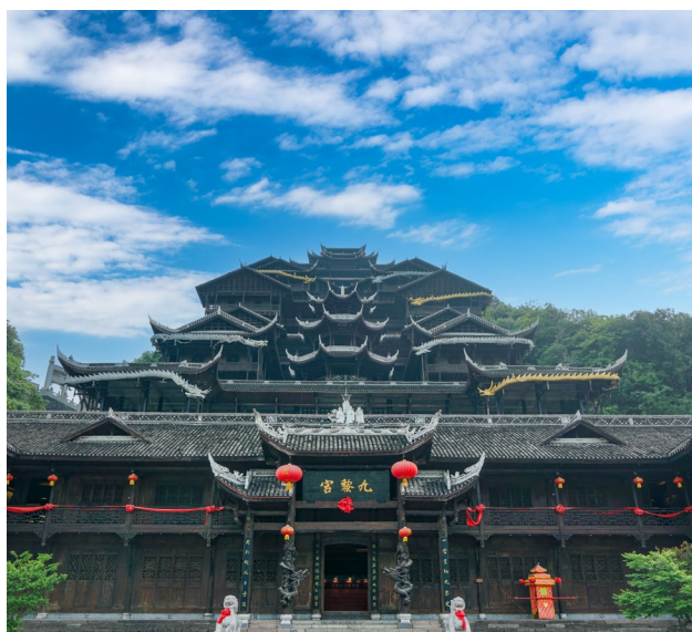
Chiyou Jiuli City | 磁器口古镇