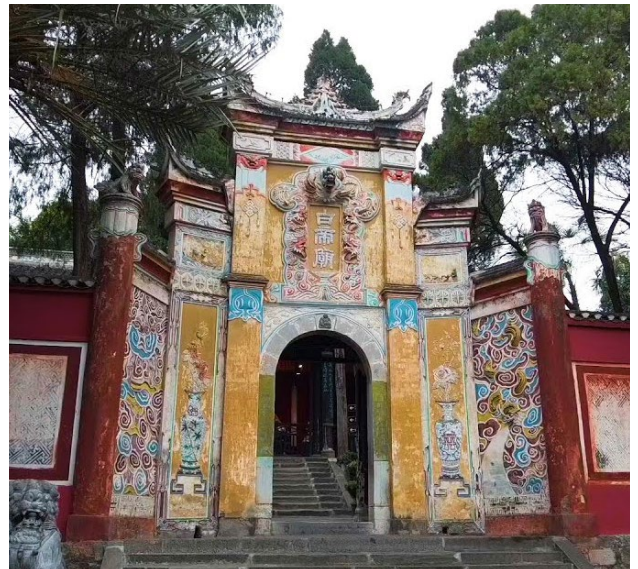
Baidi City Scenic Area | 白帝城景区