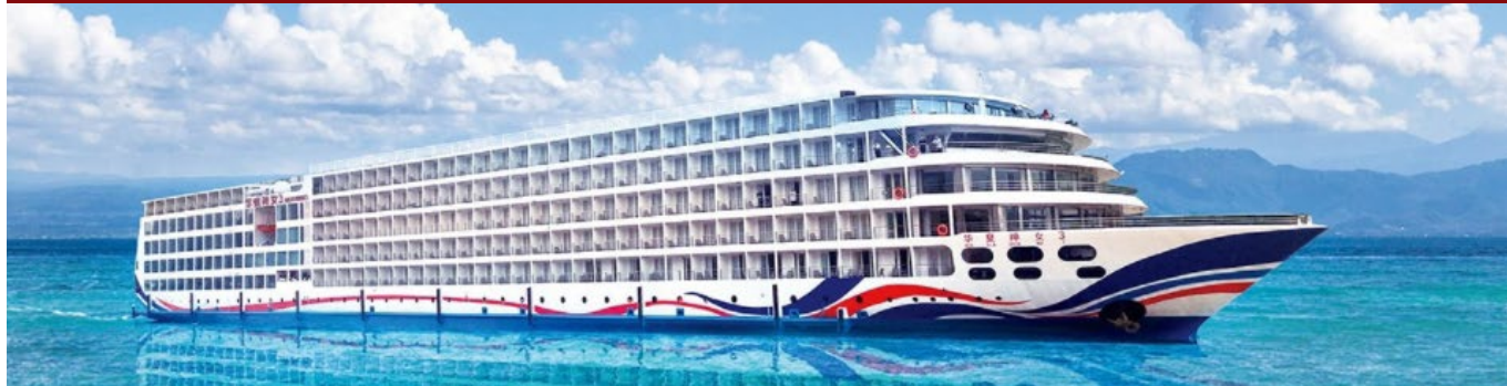
Luxury Huaxia No.3 Cruise | 豪华华夏3号游轮