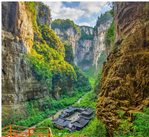
Three Natural Bridges | 天生三桥