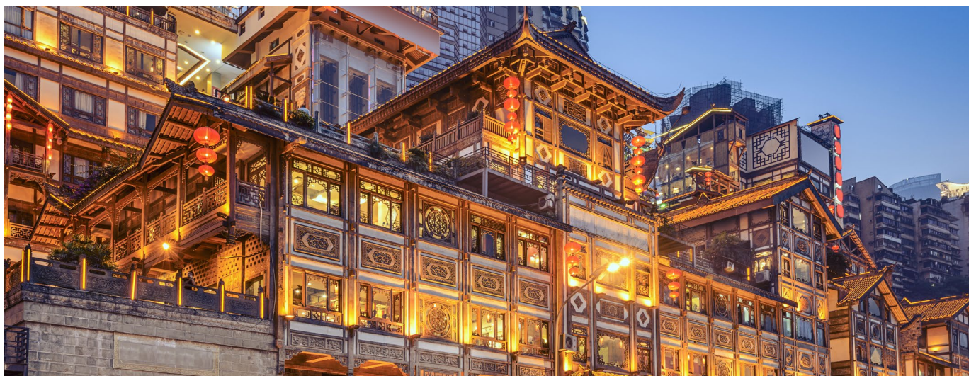
Hong Ya Cave | 洪崖洞