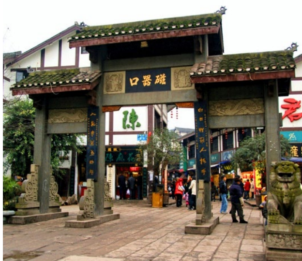
Ci Qi Kou Ancient Town | 磁器口古镇