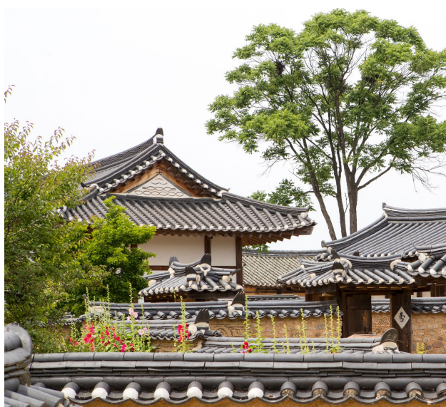
Andong Hahoe Folk Village | 安东河户民俗村