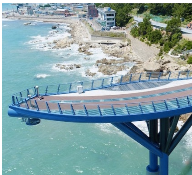
Cheongsapo Skywalk | 青沙浦展望台