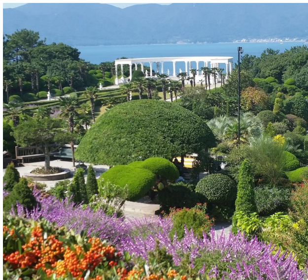
Oedo Botania | 海上花园波塔尼亚