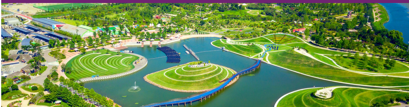
Geoje Island | 巨济岛