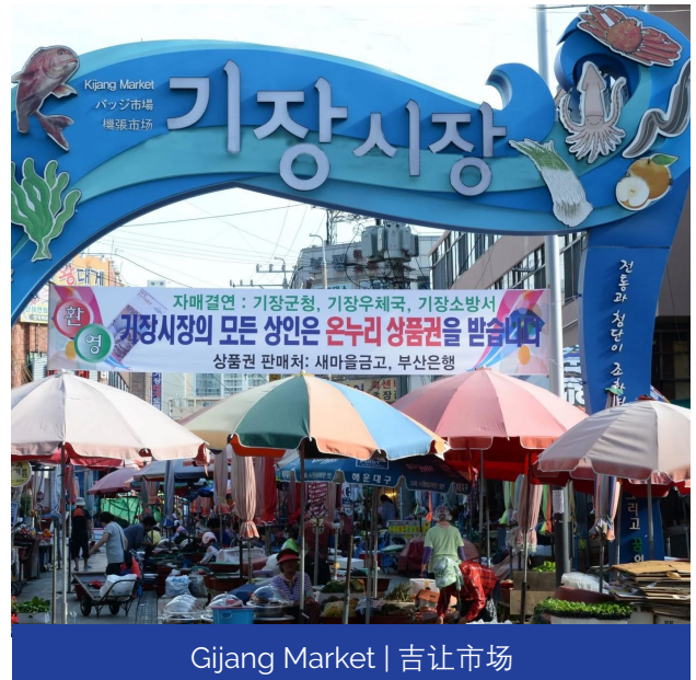
Gijang Market | 吉让市场