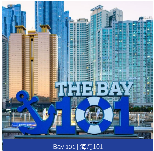
Bay 101 | 海湾101