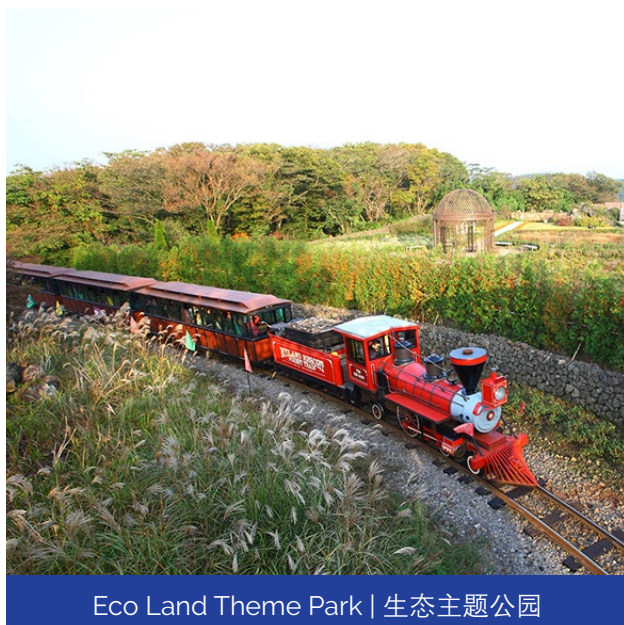
Eco Land Theme Park | 生态主题公园