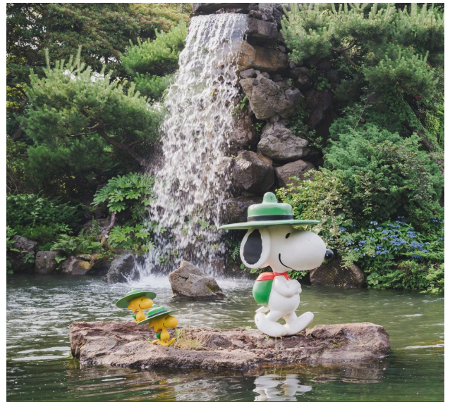
Snoopy Garden | 史努比主题乐园