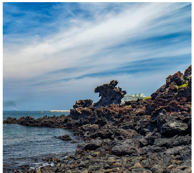
Yongduam | 龙头岩