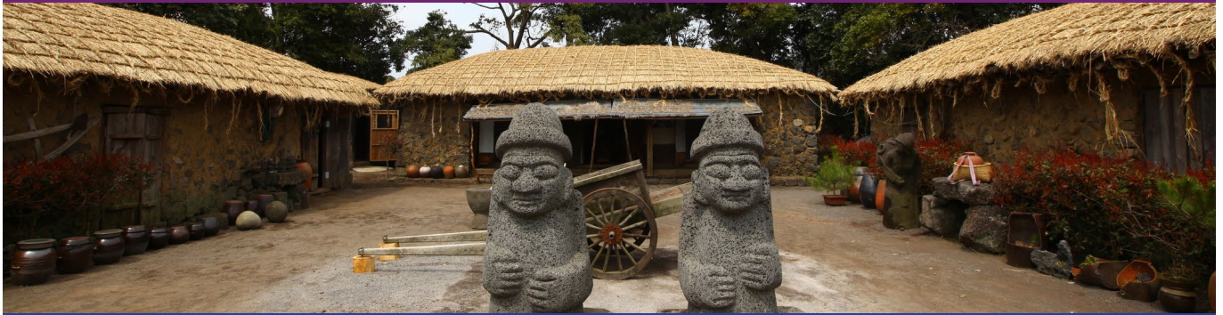
Folk Village | 济州民俗村博物馆