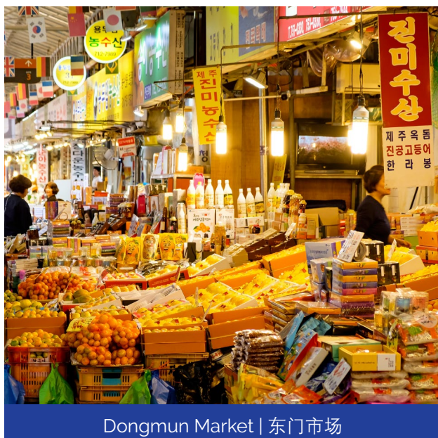
Dongmun Market | 东门市场