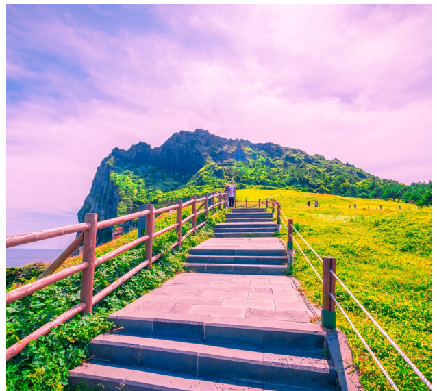
Seongsan Sunrise Peak | 城山日出峰