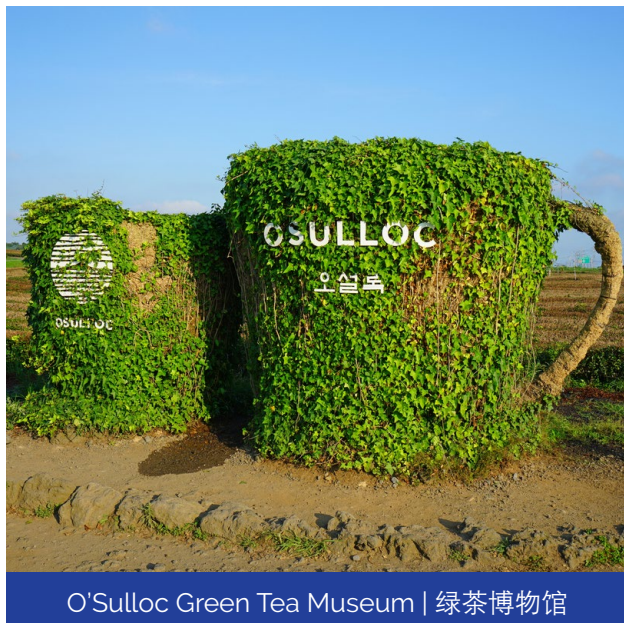
O'Sulloc Green Tea Museum | 绿茶博物馆