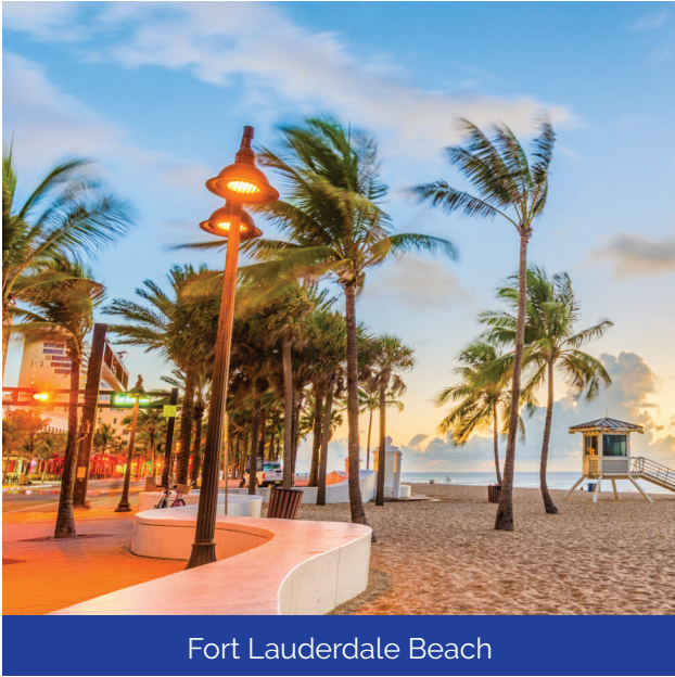
Fort Lauderdale Beach