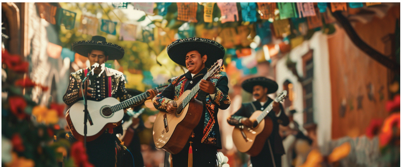
Mariachi Music Show