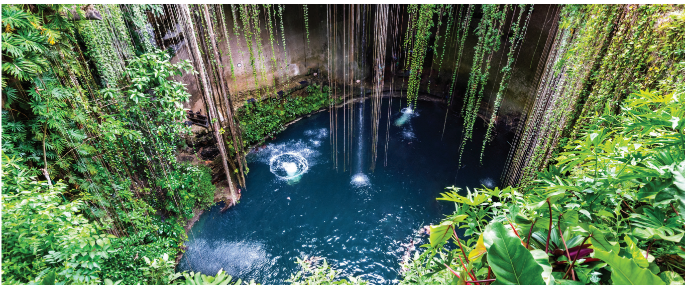
Cenote X'ux Ha