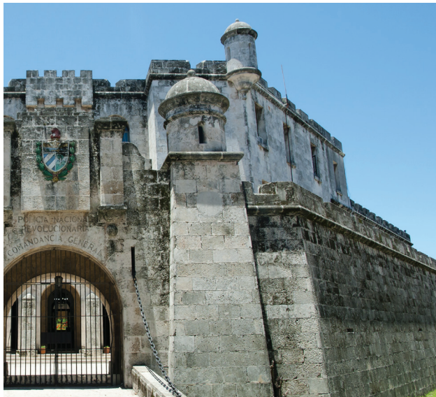
Castillo De La Fuerza Real