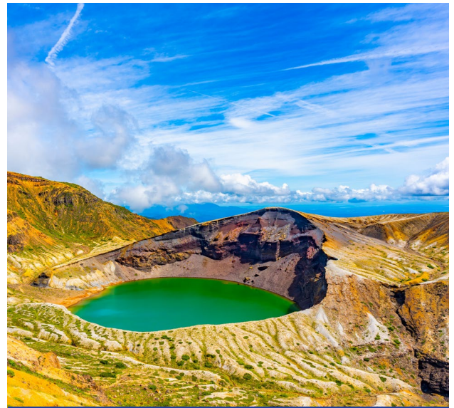
Mt.Zao | 藏王山