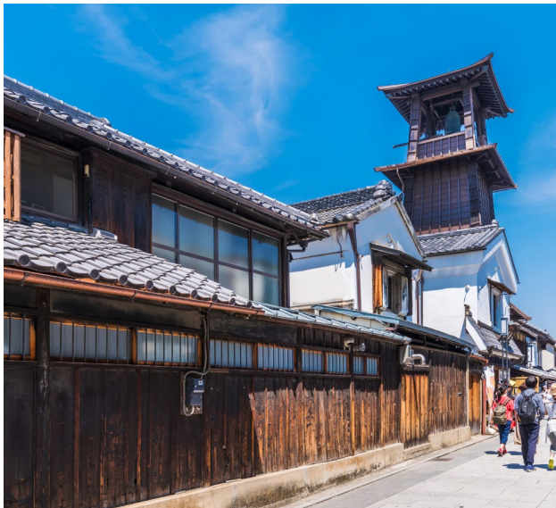
Koedo Kawagoe | 川越小江戸