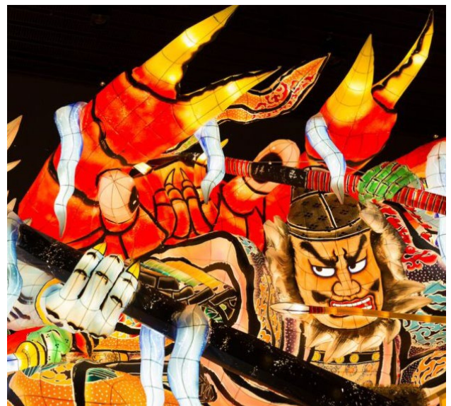
Nebuta Museum | 睡魔之家