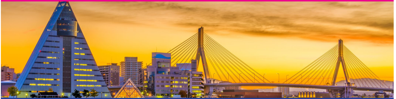
ASPAM | 青森县观光物产馆