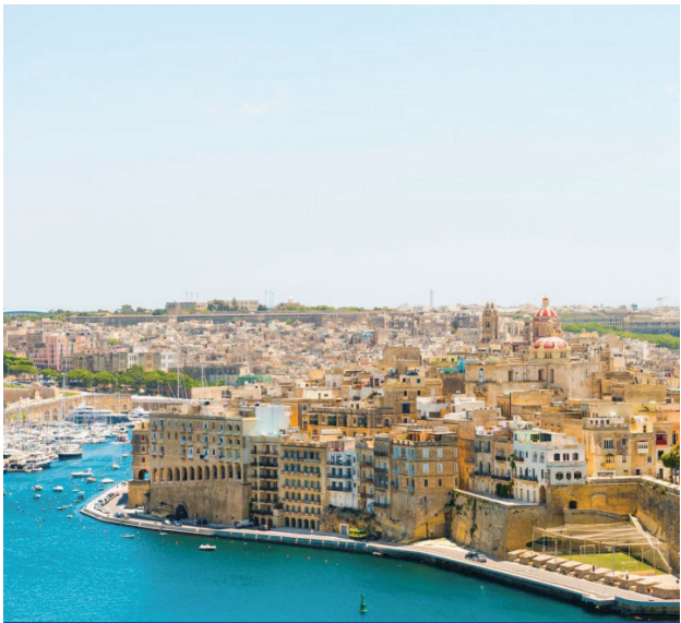
La Valleta | 瓦莱塔