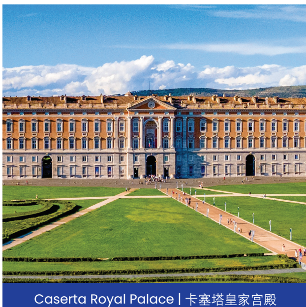
Caserta Royal Palace | 卡塞塔皇家宫殿