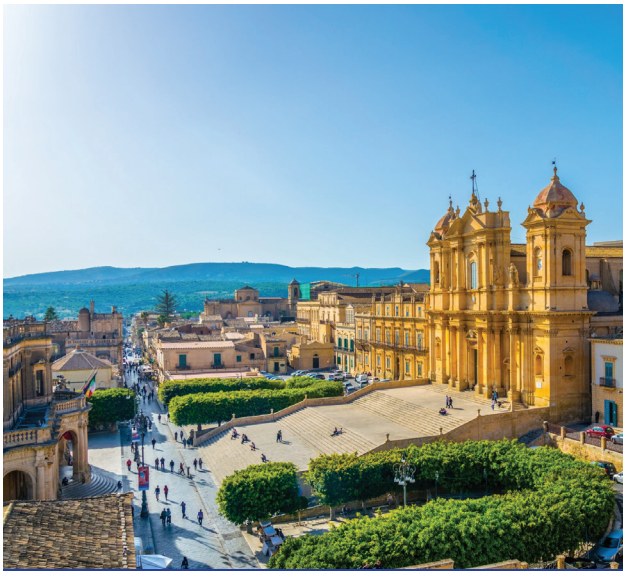
Noto | 诺托