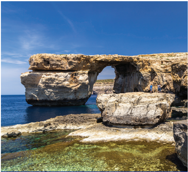
Gozo | 戈佐岛