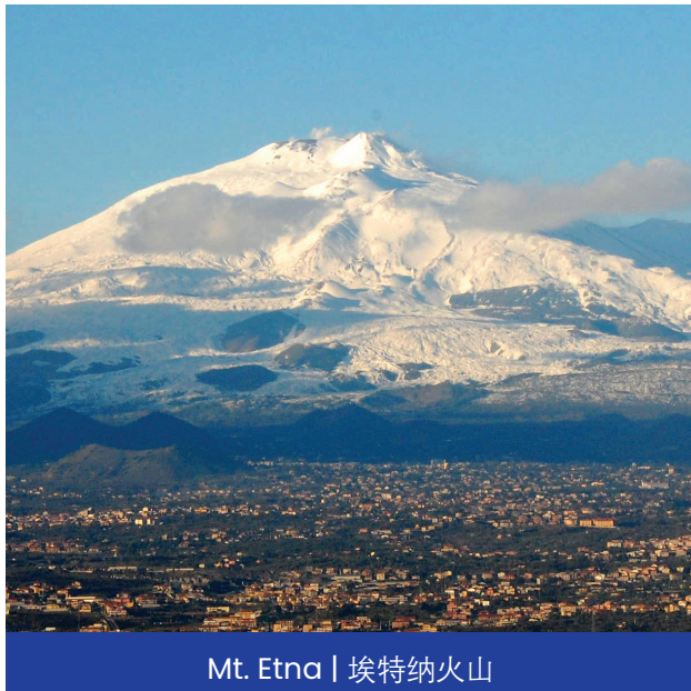
Mt. Etna | 埃特纳火山