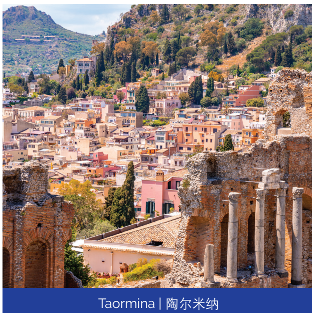
Taormina | 陶尔米纳