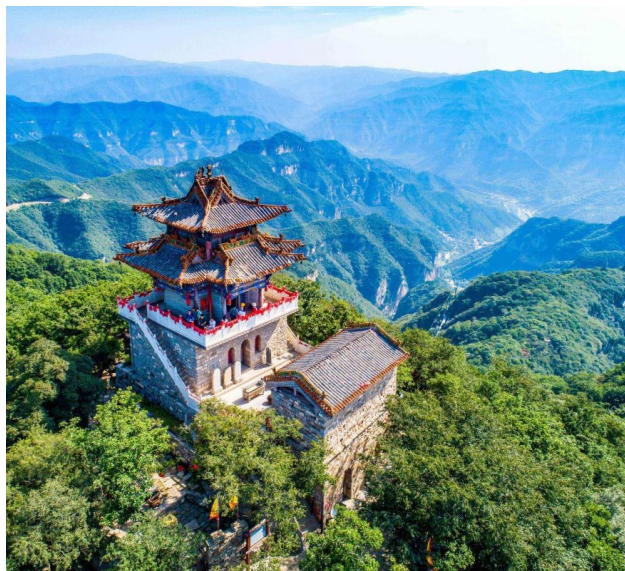
Yunqiao Mountain | 云丘山