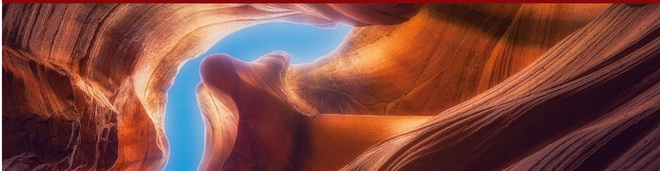
Yucha Canyon | 雨岔大峡谷