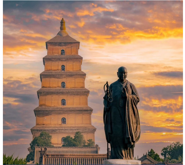
Giant Wild Goose Pagoda Square | 大雁塔广场