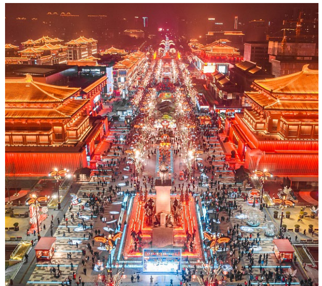
Datang Ever Bright City | 大唐不夜城