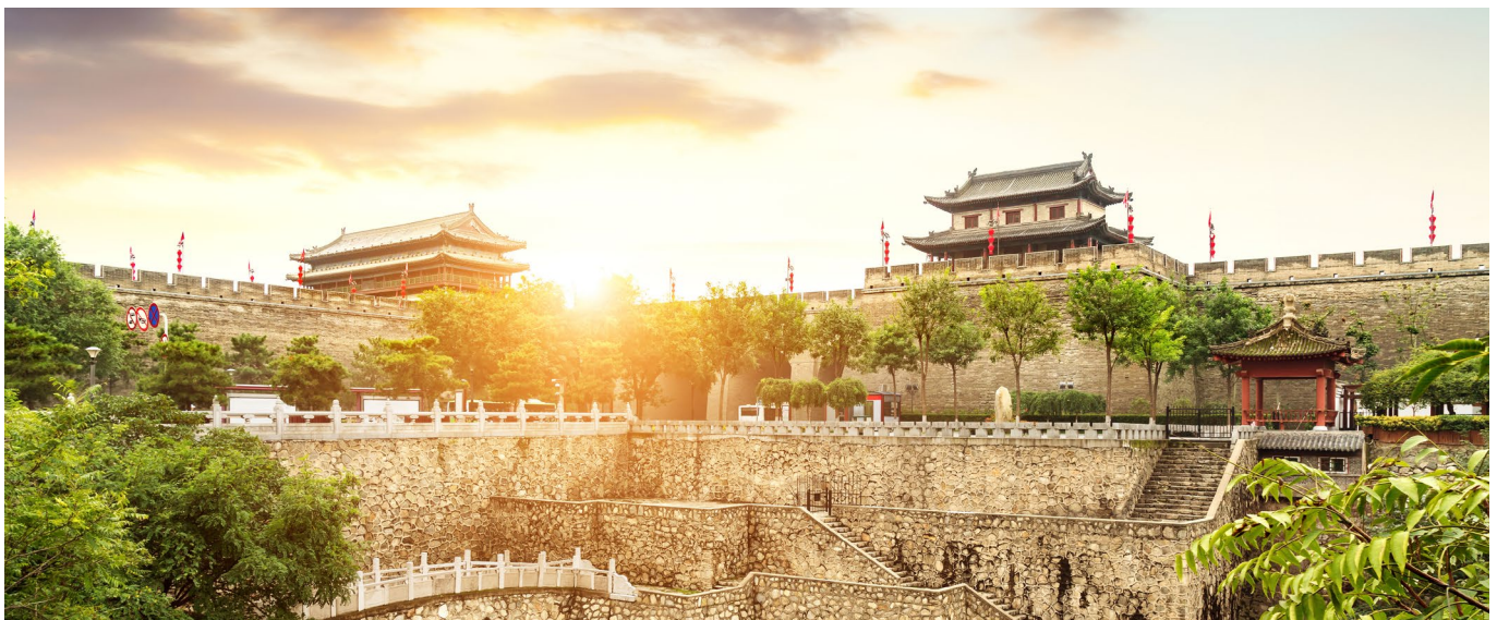
Xi'an City Wall | 西安城墙