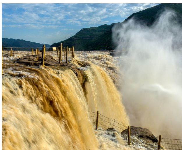
Hukou Waterfall Scenic Area | 黄河壶口瀑布风景名胜