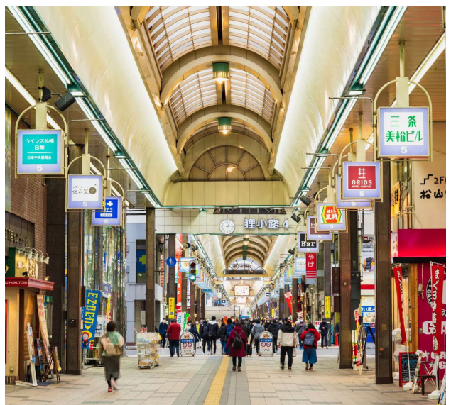
Tennuki Koji | 狸小路