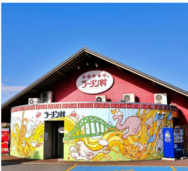
Ramen Village | 旭川拉面村