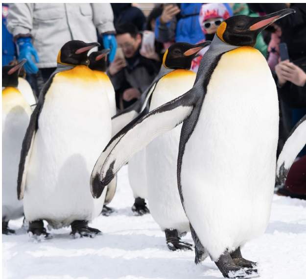
Ashiyama Zoo | 旭川动物园