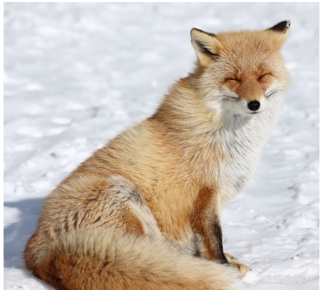
Kitakitsune Fox Farm | 狐狸村