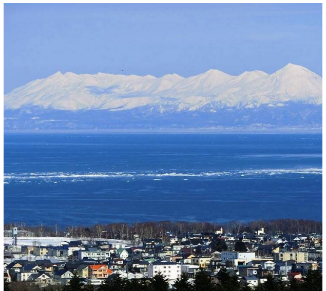
Mount Tendo | 天都山