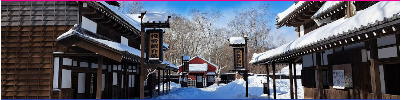
Date Jidaimura Village | 登別伊達時代村