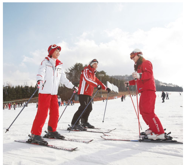
Snow Activities | 雪上活动