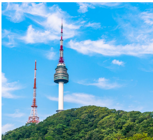
Namsan Park | 南山公园