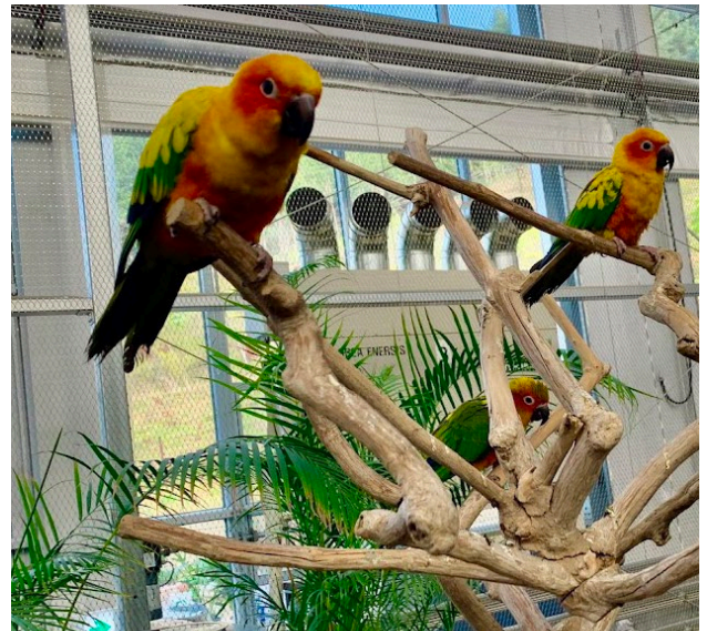
Begonia Bird Park | 海棠鸟园