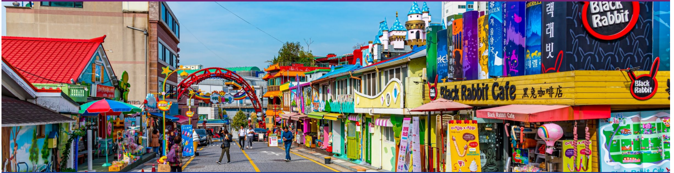
Songwol-dong Fairy Tale Village | 松月洞童话村