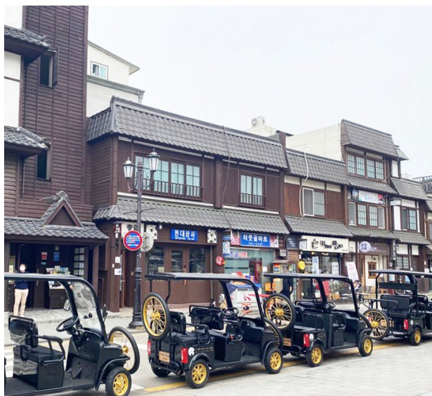
Eco Friendly Electric Car Ride | 环保电动车