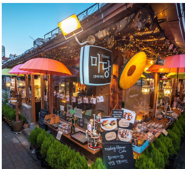
Ikseon-dong Hanok Street | 益善洞韩屋街