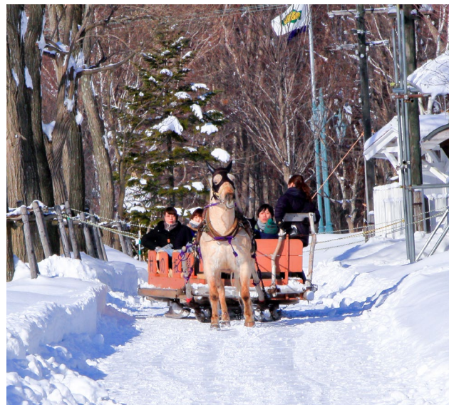
Northern Horse Park | 北国马场主题公园