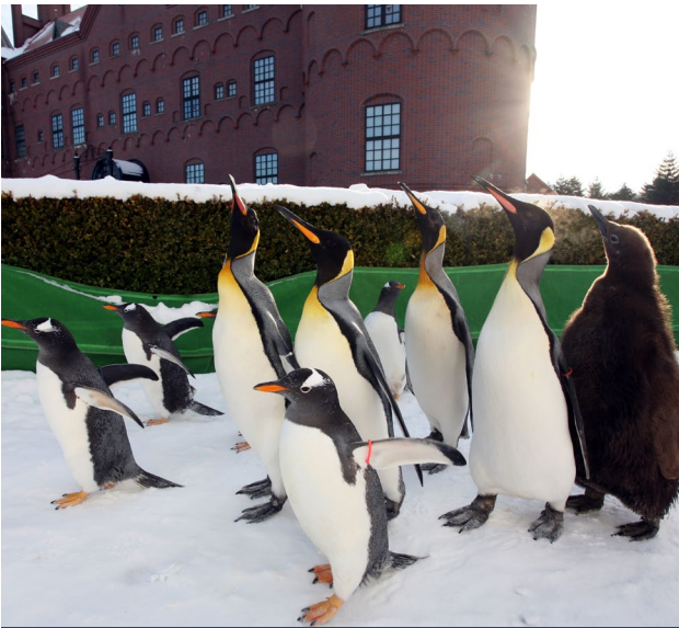
Noboribetsu Marine Park | 登別海洋公園