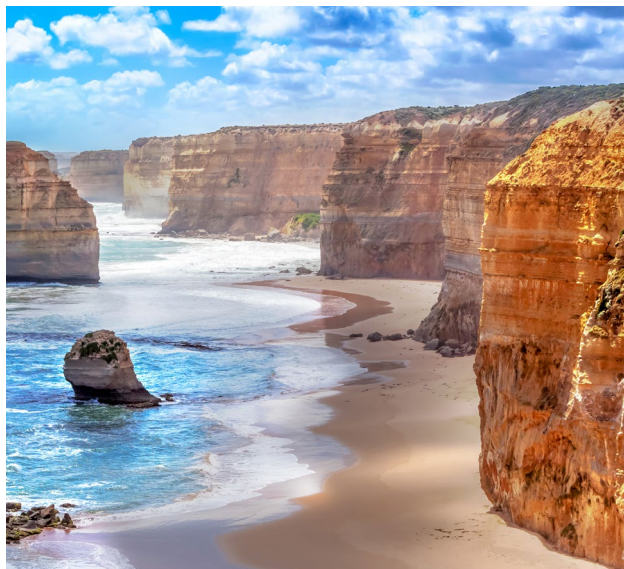
Great Ocean Road