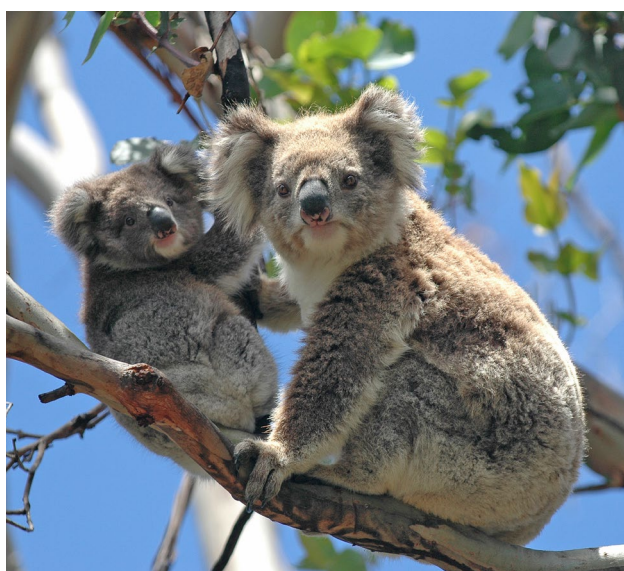
Maru Craft Wildlife Park