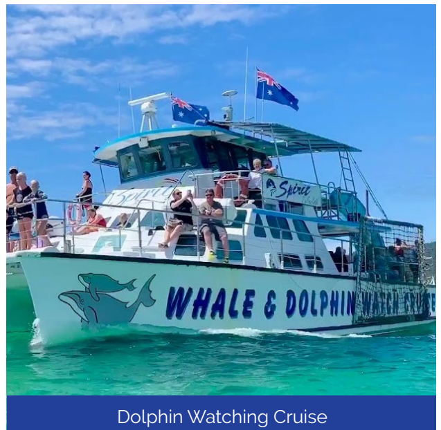
Dolphin Watching Cruise