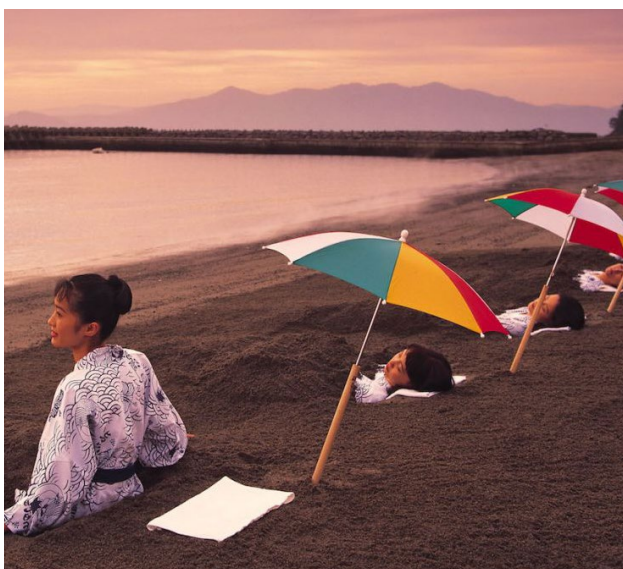
Hot Sand Bath | 热沙浴