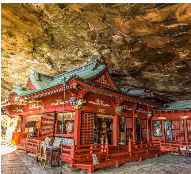
Udo Shrine | 鶴戸神宮