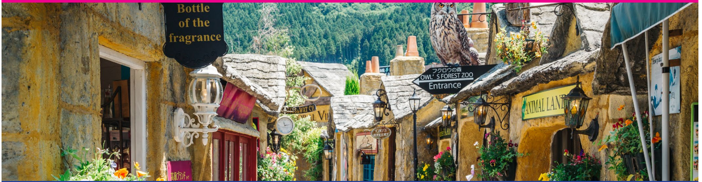
Yufuin Floral Village | 由布院花卉村