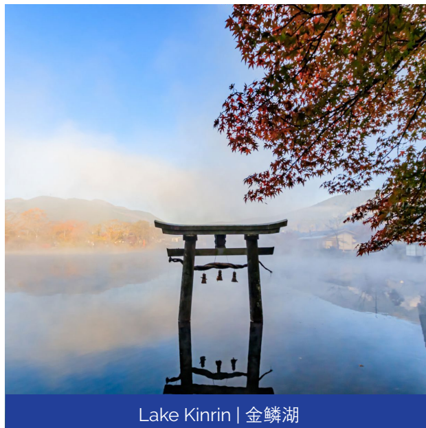
Lake Kinrin | 金鱗湖