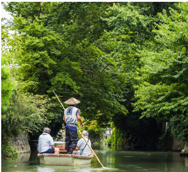
Yanagawa River Cruise | 柳川游船