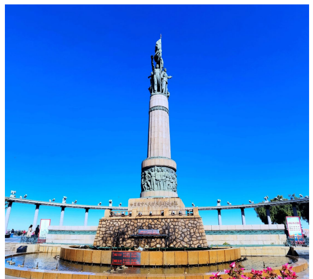
Flood Control Memorial Tower | 防洪纪念塔