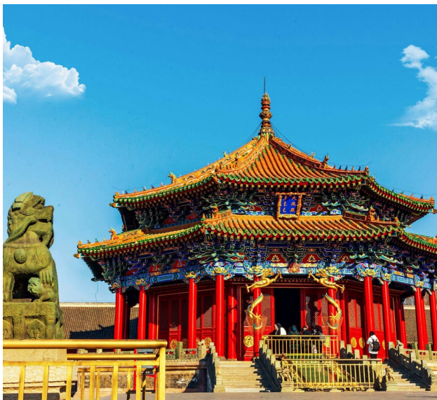
Shenyang Imperial Palace | 沈阳故宫