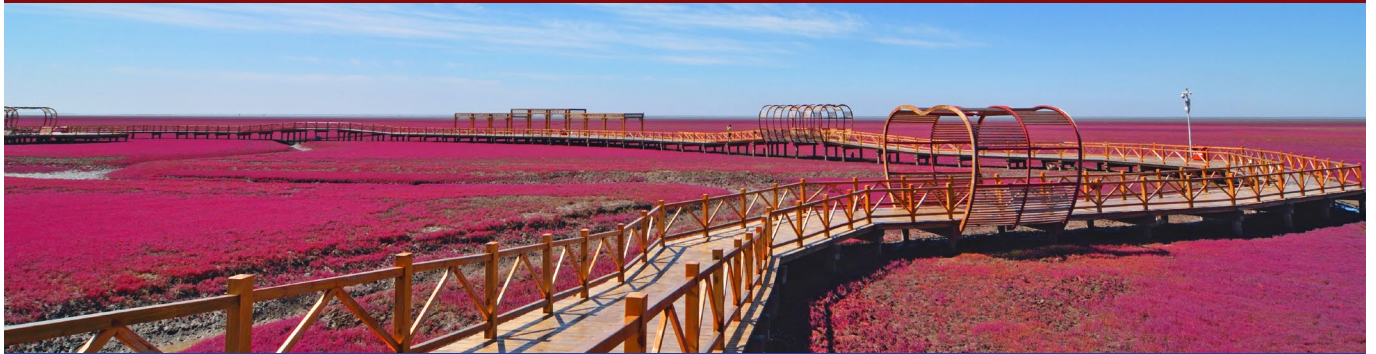
Panjin Red Beach | 盘锦红海滩