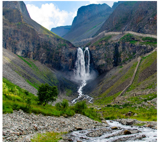
Changbai Waterfall | 长白山瀑布