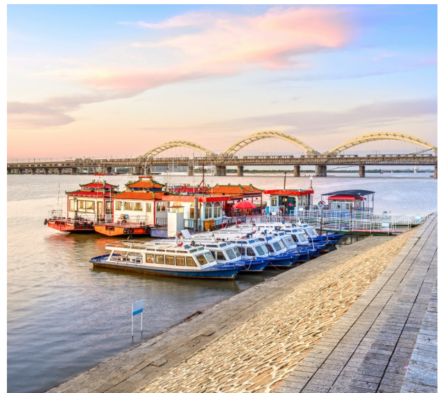
Songhua River | 松花江畔