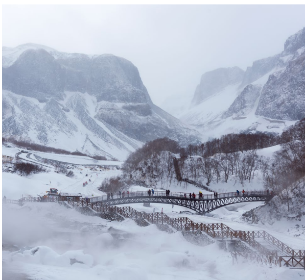
Hotel Hot Spring | 酒店温泉

Accommodation: Changbaishan Dongwo Hotel or similar