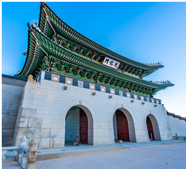
Gyeongbokgung Palace | 景福宫