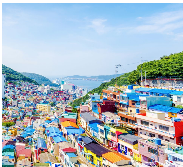
Gamcheon Culture Village | 甘川洞文化村