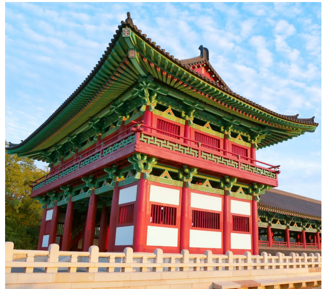
Woljeonggyo Bridge | 月精桥