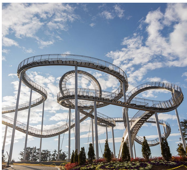
Pohang Spacewalk | 浦项天空步道