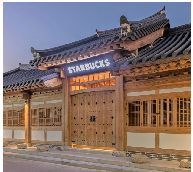
Daegu Hanok Starbucks Café | 大邱百年韩屋星巴克