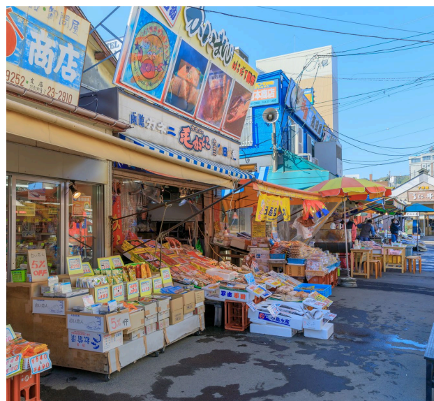
Sapporo Morning Market | 朝市