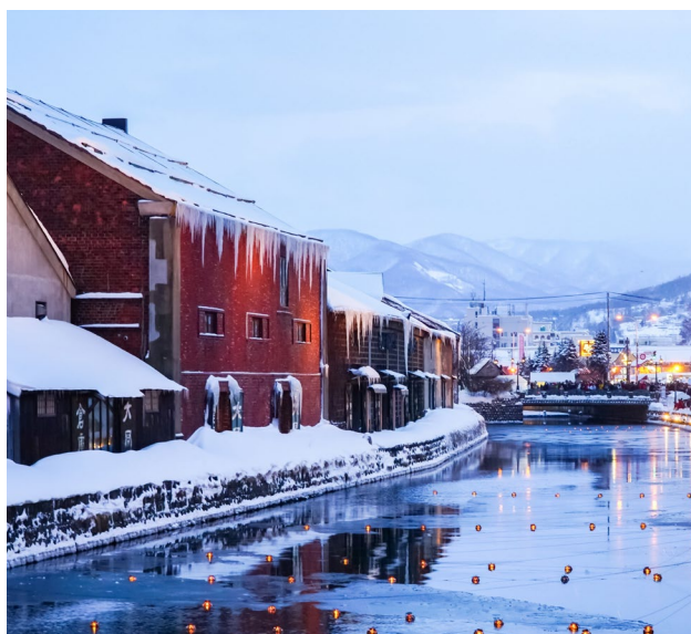
Otaru Canal | 小樽运河