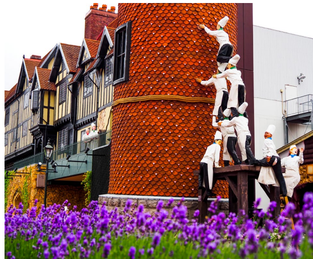
Ishiya White Chocolate Factory | 白之恋人巧克力工厂