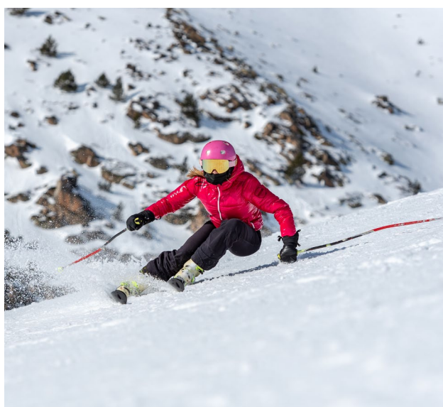
Snow Activities | 雪上活动