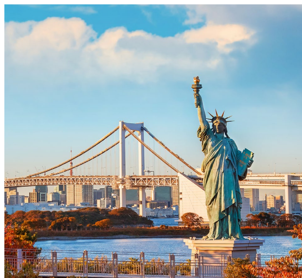
Odaiba Park | 台场公园