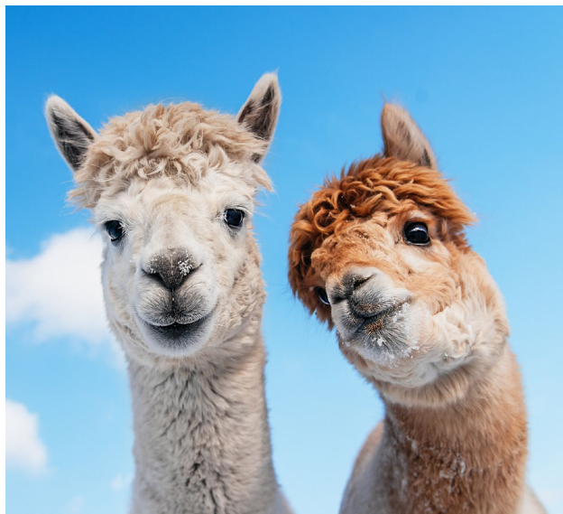
Alpaca Farm | 羊驼农场