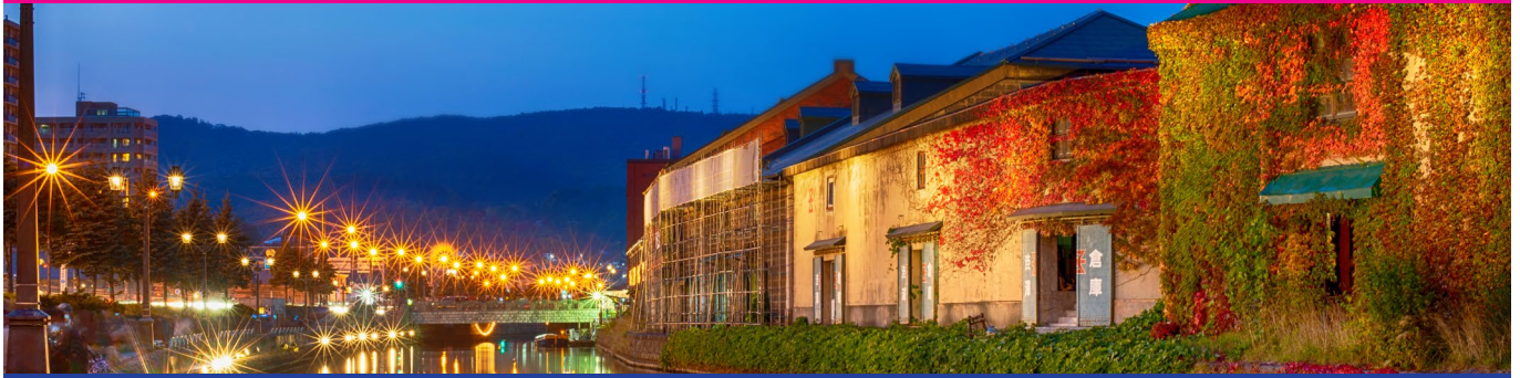
Otaru Canal | 小樽运河