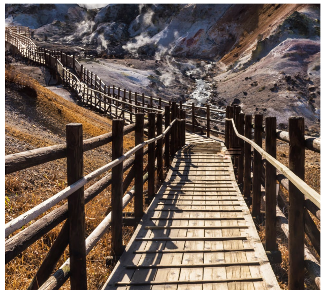
Jigokudani | 地獄谷