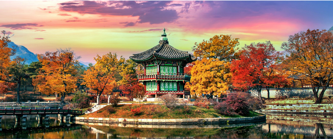
Gyeongbokgung Palace | 景福宫