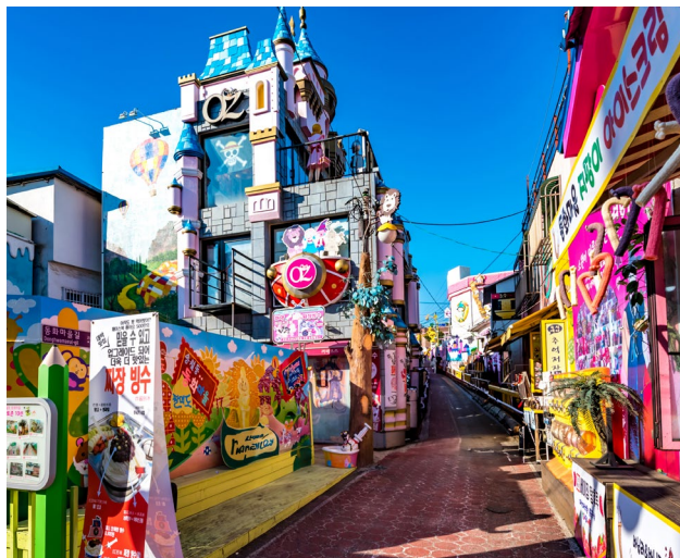
Songwol-dong Fairy Tale Village | 松月洞童话村