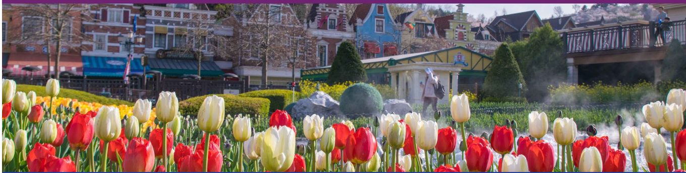
Everland | 爱宝乐园