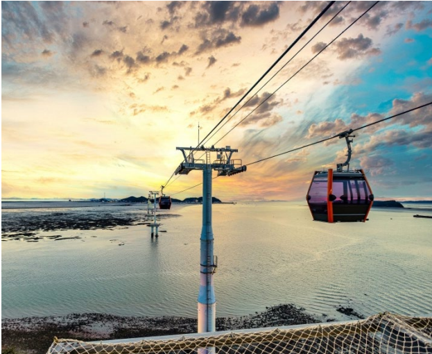
Seohaerang Jebu Marine Cable Car | 济扶岛海上缆车