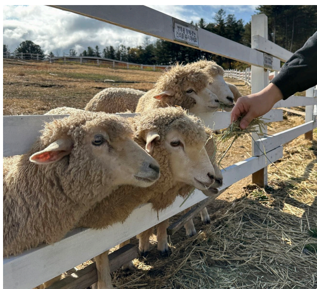
Gapyeong Sheep Farm | 加平郡羊农场