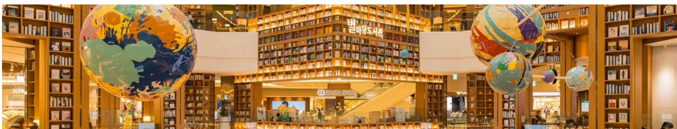
Suwon Starfield Library | 水原星空图书馆