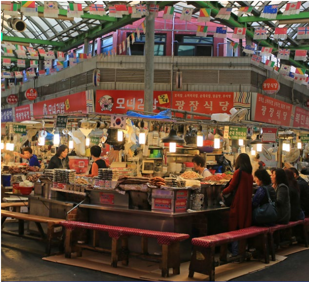
Gwangjang Market | 广藏市场