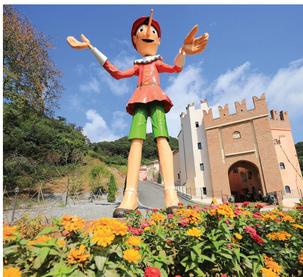
Pinocchio Theme Park | 匹诺曹主题公园